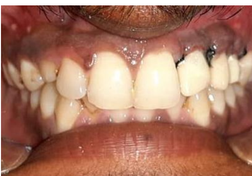
Fig. 7: Provisional restoration