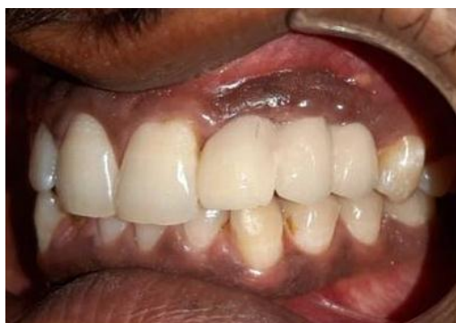
Fig. 9: Definite prosthesis