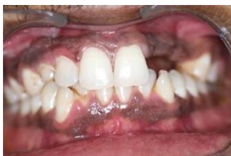
Fig. 1: Pre-op intraoral view

Insufficient bone volume can be augmented successfully by combining various methods of bone augmentation. This case resulted into successful bone augmentation by combining ridge split technique along with bone grafting supported by guided bone regeneration as collagen membrane have been used as barrier membrane. The overall result is successful PFM prosthetic rehabilitation in aesthetic area after bone augmentation procedure.