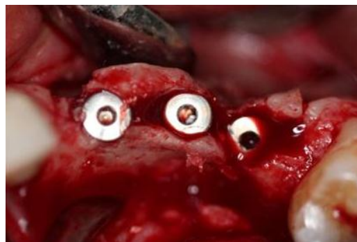
Fig. 4: Implant placement