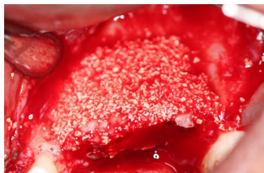
Fig. 5: Bone graft filled between implant and cortical plate