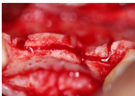
Fig. 3: Alveolar ridge showing Ridge split