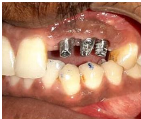
Fig. 8: Abutment preparation