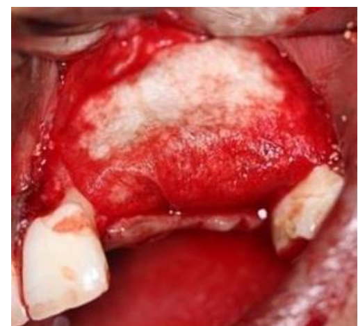
Fig. 6: Barrier membrane