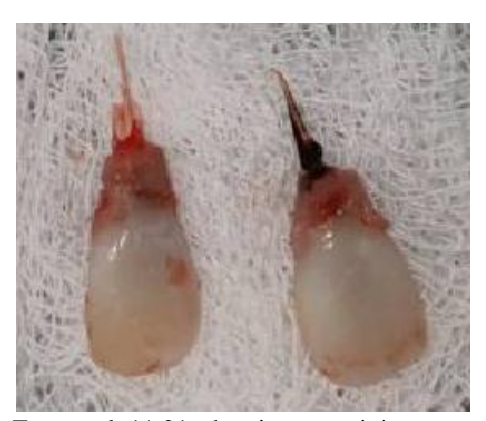
Fig. 3: Extracted 11,21 showing remaining gutta percha points.