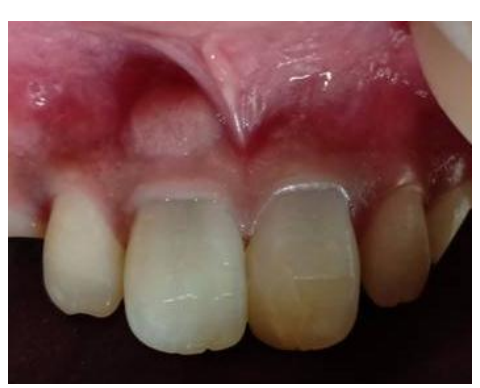
Fig. 2: Preoperative photographs showing sinus tract with respect to 11.