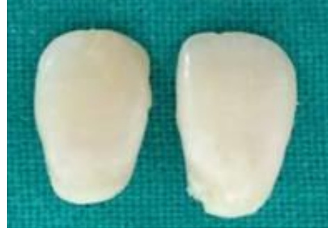
Fig. 5: Natural teeth prepared to be used as pontic.