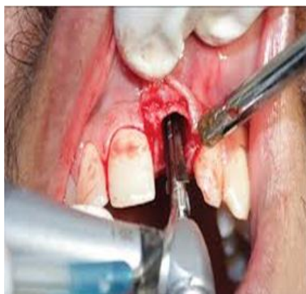
Fig. 17: Implant placed