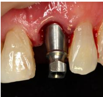
Fig. 11: Placement of single piece implant