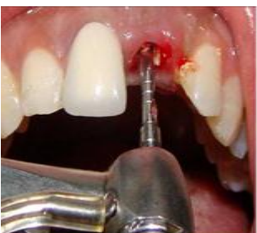
Fig. 4: Implant drill to remove the root stumps