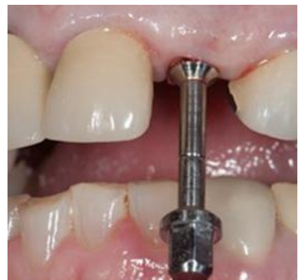
Fig. 15: Removing root stump using xtrac system