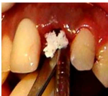
Fig. 6: Osseograft used for filling the socket