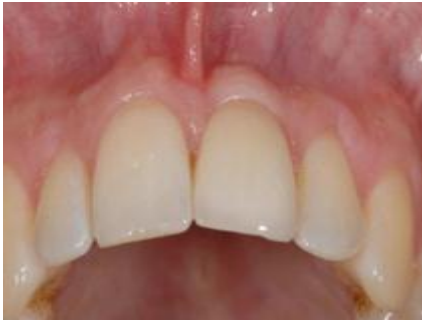
Fig. 8a: Final restoration with ceramic crown