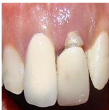
Fig. 1: Fractured crown in relation to I1