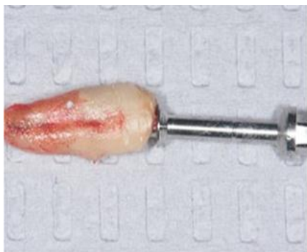
Fig. 16: Removed root stump