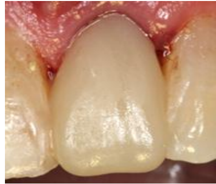
Fig. 12: Final restoration using adora crown