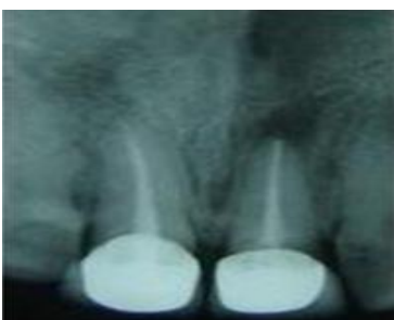
Fig. 2: Radiograph showing fracture at cemento-enamel junction