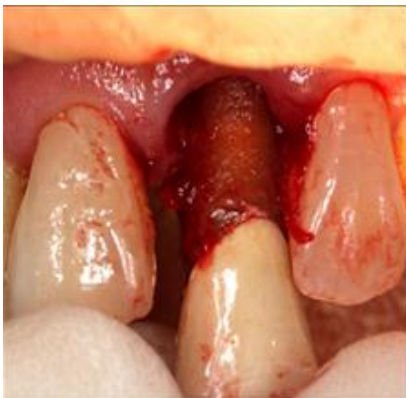
Fig. 9: Tooth removed using periosteal elevator