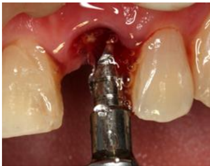
Fig. 10: Implant drill widening the socket