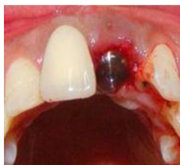
Fig. 8: Clinical picture showing heading cap