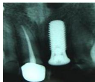
Fig. 7: Radiograph showing immediate implant