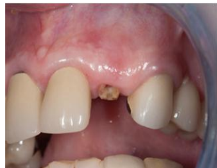
Fig. 13: Clinical picture showing root stumps