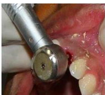
Fig. 3: Airrotor drilling the orifice of the root stump