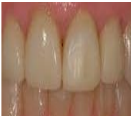
Fig. 18: Final restoration with ceramic crown