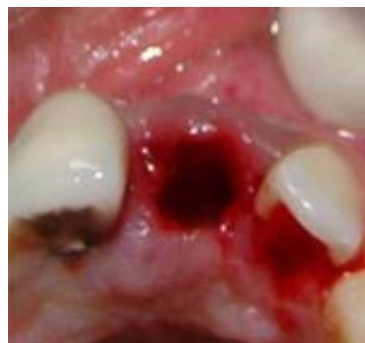
Fig. 5: Clinical picture of extracted socket