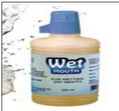
Fig. 6: Artificial substitute