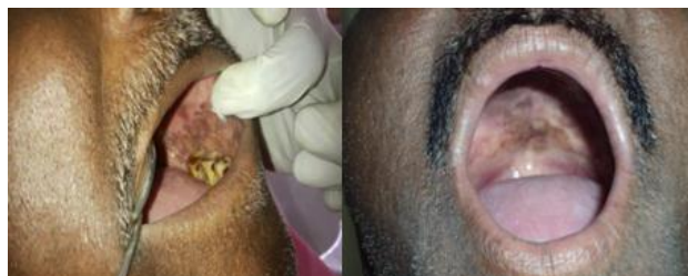
Fig. 1: Multiple local conditions (oral sub mucous fibrosis with blanching mucosa, Pseudomembranous growth on hard palate, Fissured tongue)