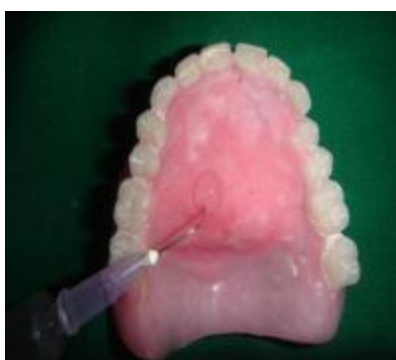
Fig. 7: Incorporation of salivary Substitute in reservoir space.