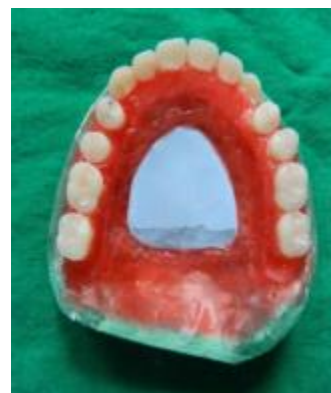
Fig. 4: Reservoir space created with putty