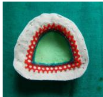
Fig. 2: Waxpattern on refractory cast.