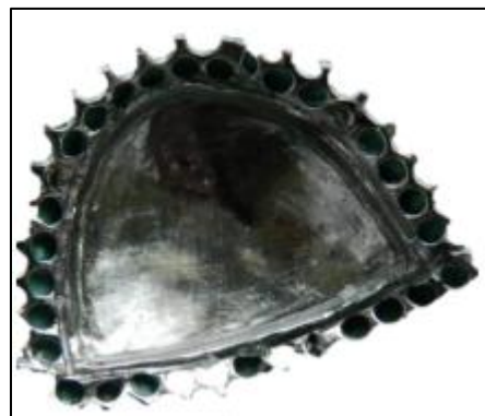
Fig. 3: Cast metal base