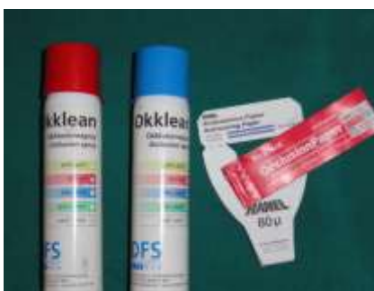
Fig. 2: Occlusal Indicators:- spray and articulating papers