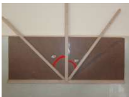
Fig. 1: Customized goniometer