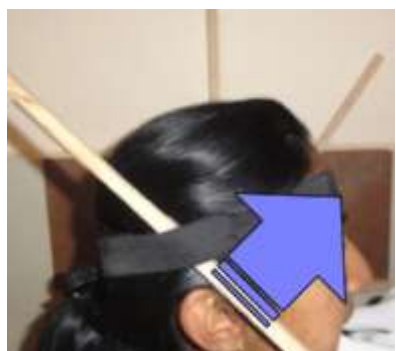
Fig. 4: 45 0 dorsoflexion