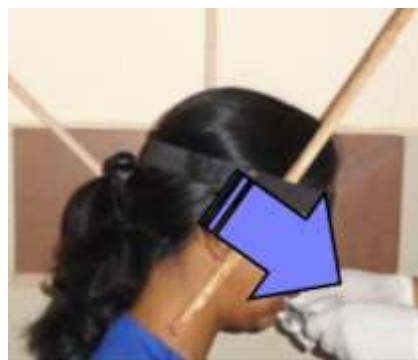
Fig. 5: 30 0 ventroflexion