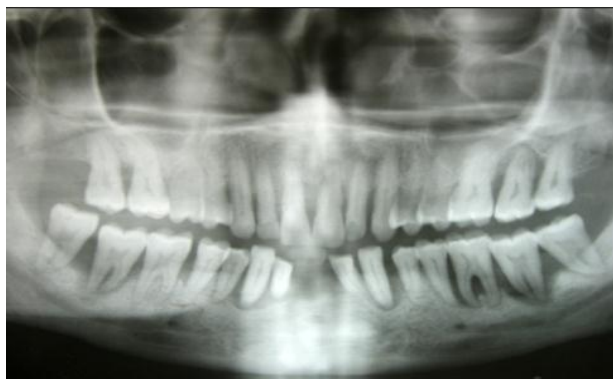
Fig. 2: Orthopantogram