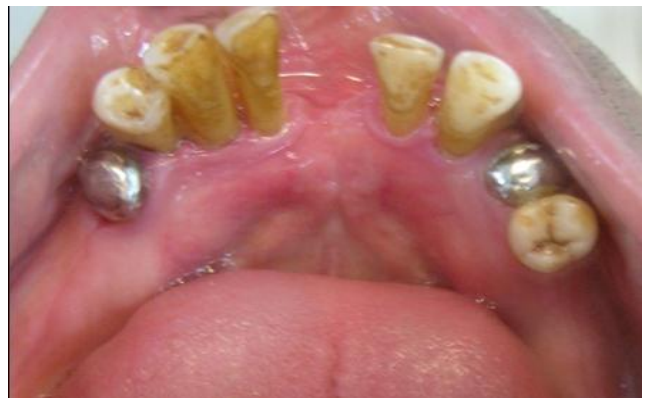
Fig. 4: Metal copings cemented over selected overdenture abutments