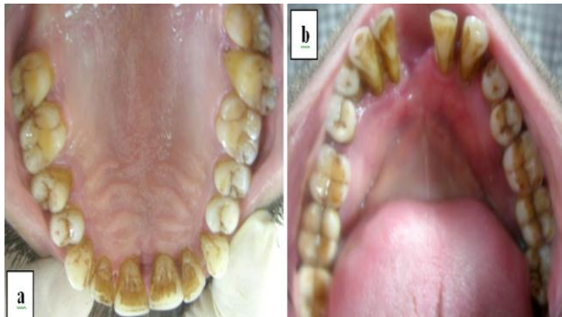
Fig. 1: (a & b). Intra oral view of maxillary and mandibular dentition