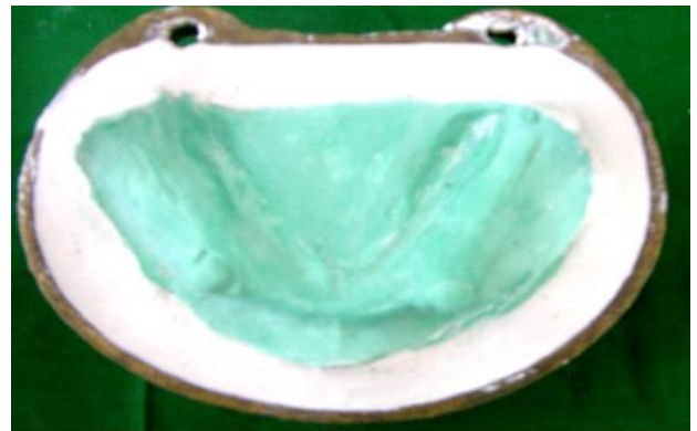
Fig. 5: Duplicated cast for fabricating clear acrylic surgical template