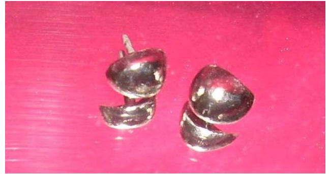
Fig. 3: Metal copings ready for cementation