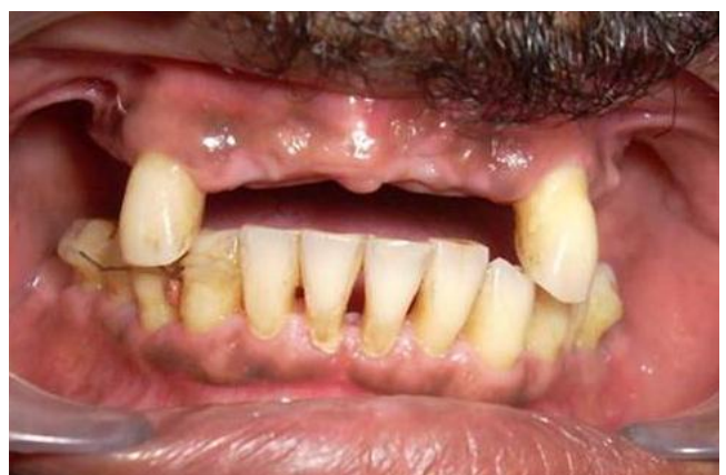
Fig. 6: Intraoral pretreatment view