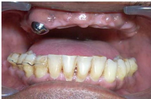
Fig. 7: Copings cemented