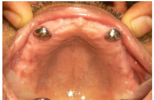
Fig. 4: Copings cemented over prepared canines