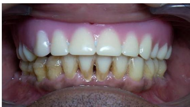
Fig. 8: Single maxillary denture placed opposing natural teeth