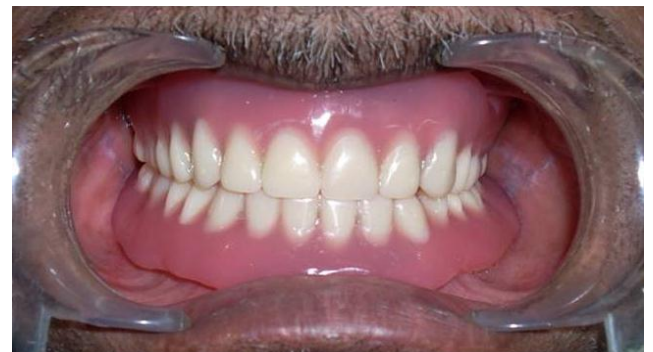
Fig. 5: Denture placed over abutments with copings.