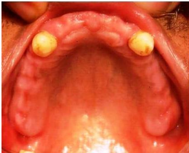
Fig. 1: Intraoral preoperative view

Patients were instructed for proper home care and hygiene maintenance of the removable prosthesis and placed on a regular recall programme. A correct brushing technique was taught to the patients for cleaning the prosthesis. Oral hygiene instructions for maintenance of abutment and copings were given. They were advised to use soft tooth brush around the coping and asked to leave the dentures out of the mouth, in a denture cleansing solution overnight.