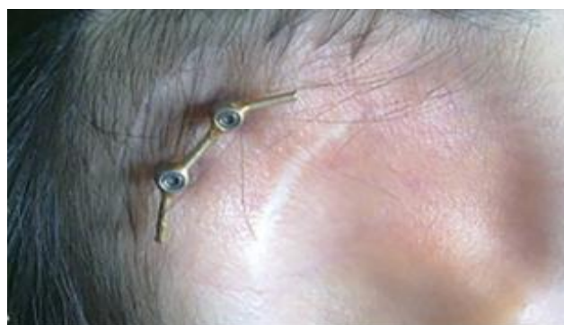
Fig. 5: Implants with abutments joined through bar in C-shape. 13

Three retentive clips or magnets and a bar do not appear to compromise the contours of the prosthesis. The presurgical waxed prosthesis will determine whether magnets or retentive clips should be used. An acrylic resin section is constructed within the prosthesis to house the retentive elements. 15