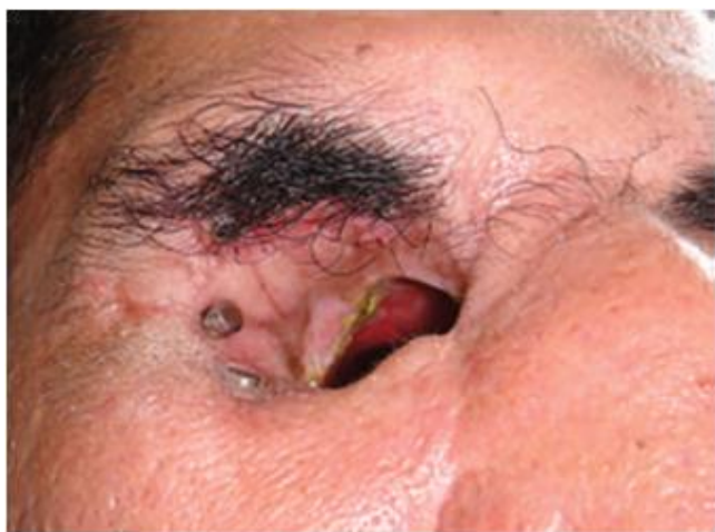
Fig. 3: Superior, Lateral and inferior orbital rims are favourable sites for implant placement. 13

Normally, the anterior position of the ocular prosthesis is 5 to 8 mm posterior to the supraorbital rim, 0 to 2 mm posterior to the infraorbital rim, and 8 to 12 mm anterior to the lateral orbital rim. It may be necessary to use the medial walls of the defect for additional retention and stability. 14