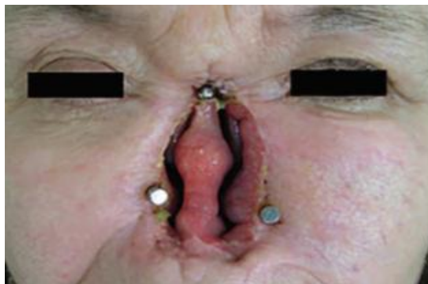
Fig. 4: Anterior part of maxilla or lateral rounded eminence serve as preferred sites for implant placement. 13

retentive elements do not compromise the contours of the prosthesis. 15