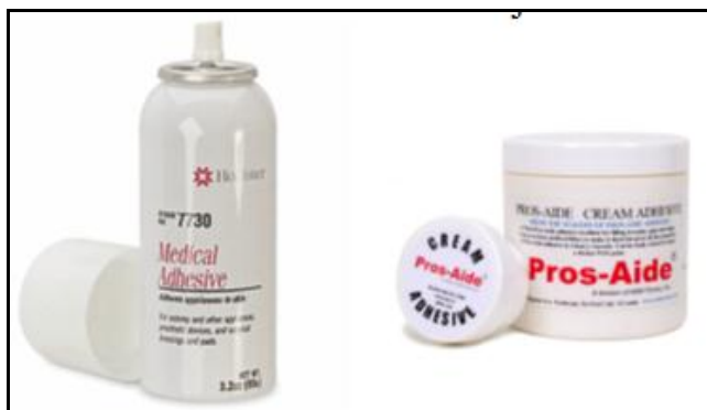
Fig. 2: Adhesives for Maxillofacial Prosthesis 10

The MDX silicone material has a greater edge strength than other silicone materials and its further reinforcement with nylon mesh provides it adequate edge strength facilitating its use in thinner areas which are responsible for blending with the adjacent skin. A mild adhesive does not irritate the tissues nor does it damages the prosthesis, but only functions to acts as a sealant hence does not serve as a major source of retention. 9