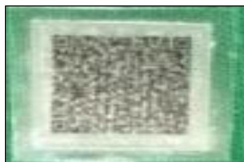
Fig.6: Laminated using clear acrylic resin