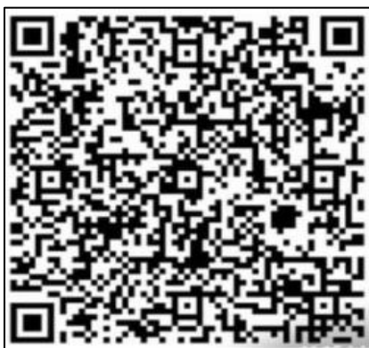
Fig. 4: QR Code is generated

Barcode: A barcode is an optical machine-readable code in the form of patterns which is a representation of data barcode scanner is used to read this kind of patterns. Barcodes is a better incorporation. Technique as it stores a huge amount of patient's details as compared to labels which just includes name and ID number. Quick response code is a two dimensional (2D) type of barcode 16,17 Fig. 4.