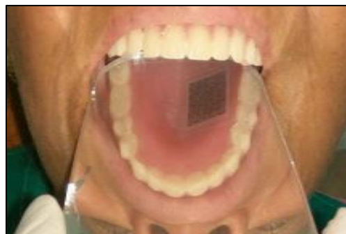
Fig. 11: QR code scanned details