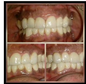
Fig. 11: Final crowns: Frontal, Left lateral and Right lateral views