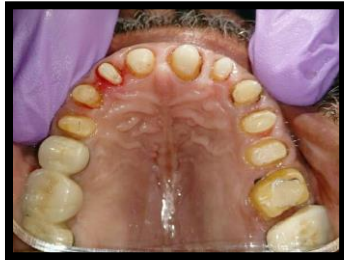
Fig. 3: Crown Preparations: Maxillary Arch