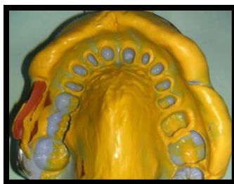
Fig. 5: Final Impressions: Maxillary Arch