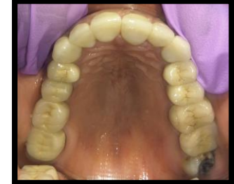
Fig. 9: Final Crowns: Maxillary Arch