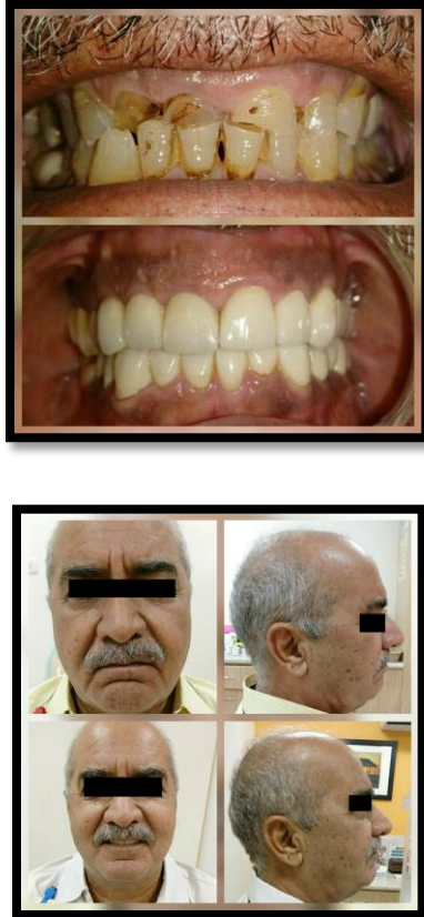
Fig. 12 & 13: Notice the change: When you make someone smile again!!!!