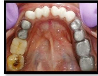
Fig. 8: Coping Try-in: Mandibular Arch