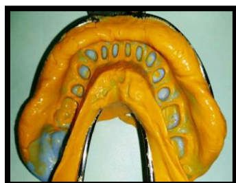
Fig. 6: Final Impressions: Mandibular Arch