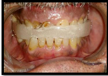
Fig. 2: Removable Bite Raising Splint