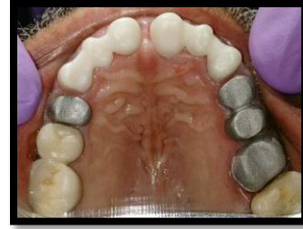
Fig. 7: Coping Try-in: Maxillary Arch