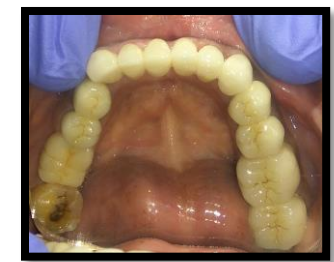
Final 10: Final Crowns: Maxillary Arch