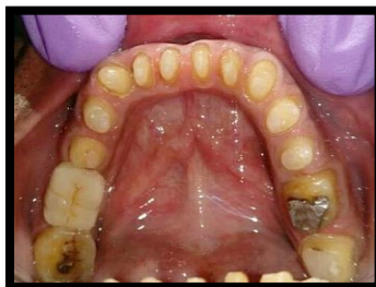
Fig. 4: Crown Preparations: Mandibular Arch