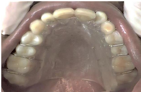
Fig. 2: Intra-oral view of prosthesis