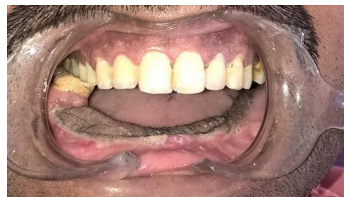
Fig. 7: Intra-oral view showing deviation of mandible towards the non-resected side

Next, is a case of a 36 year old male reporting with unilateral discontinuity mandibular defect due to an extensive resection of the mandible on the left side three years ago for follicular ameloblastoma. Defect was rehabilitated with a free-fibular bone graft. A buccal-based guidance flange prosthesis was planned on the non-resected side and retention was derived from C-clasps and Adam's clasps in the premolars and molars respectively. A ramp-like extension was made on the buccal aspect on the right side with heat-cure poly-methylmethacrylate. (Fig. 7, 8)