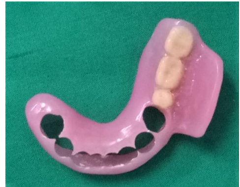
Fig. 5: Finished and polished cue-sil prosthesis