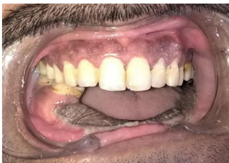
Fig. 8: Intra-oral view of correction of deviation after appliance therapy

For all the above cases, the guide flange was fabricated in such a way so that the cheek and tongue was effectively out of the path of closure. 7 Mandibular exercises were suggested to aid in faster correction of mandibular deviation. Post treatment with a guide flange prosthesis, the patient was able to achieve the medio-lateral position of the mandible which corrected the deviation and facial asymmetry and was able to repeat this position for adequate mastication. Patients were instructed to maintain proper oral hygiene and care for their prosthesis.