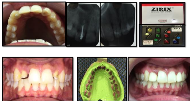
Fig. 4: Zirconia post steps of fabrication