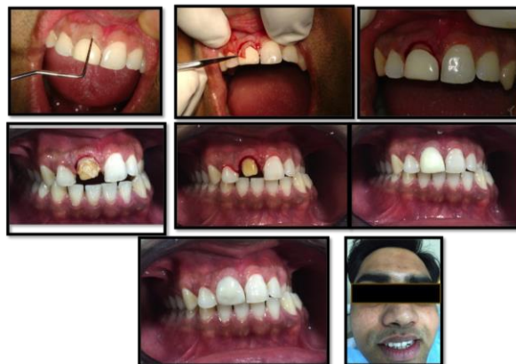
Fig. 2: Traditional gingival contouring