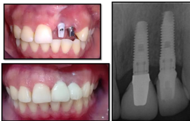
Fig. 3: Zirconia Abutment

Esthetic means of ensuring smile design in implants are gingival contouring, ridge augmentation, various provisionals, customized abutments and gingival formers with the biggest breakthrough being Zirconia abutments as shown in Fig. 3.