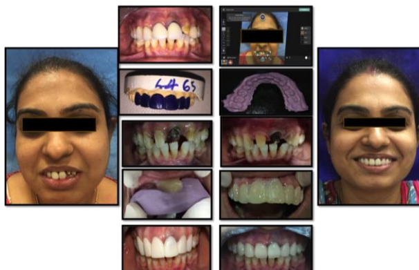
Fig. 1: Traditional digital smile design

Traditional approach to esthetic smile design includes laminate veneers. The steps in the traditional concept for laminate veneers include taking thorough case history, making a diagnostic impression, mounting with facebow transfer and radiographs include intraoral periapical radiograph and orthopantomogram. A well-adapted, horizontally sectioned silicon matrix made from the diagnostic cast is used as a reference for teeth reduction. 8 After teeth preparation using depth cut burs a full arch impression is made with rubber base impression materials. Shade selection is done with Vita shade guide (3D Master). The porcelain laminate is processed in the laboratory using either platinum foil technique or refractory die technique. Another conventional approach is two dimensional smile designs as in Fig. 1. Here patient's photographs are placed in MAC Keynote or Powerpoint and a digital two-dimensional designing can be done using the softwares available in the market. This software allows dentists to design new smiles using a simple 2D facial smile photo and intelligent teeth silhouettes. To take care of gingival or pink esthetics the conventional means was to use manual gingival contouring with scalpel and blade as shown in Fig. 2.