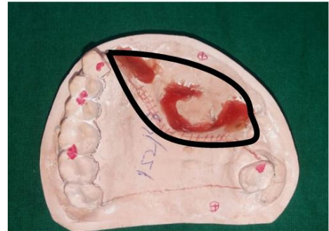
Fig. 2: Surveyed cast