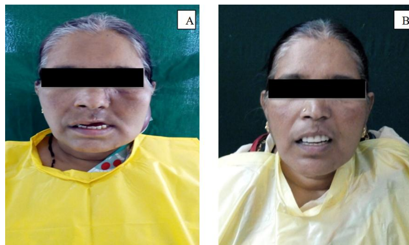
Fig 4: (A. Preoperative; (B Post operative after insertion of prosthesis

curing was done. Later sugar was removed from processed denture by injecting hot water through hole and it was later covered by self cure acrylic resin. The final prosthesis was finished, polished and insertion was done. (Fig. 4A and B)