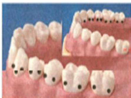
Fig. 5: Systemic representation of areas of application of Diode Laser