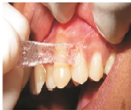
Fig. 2: Applications of Ice Stick to evaluate Dentinal hypersensitivity (Thermal Stimulation)