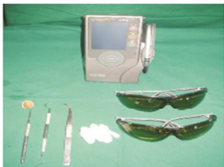
Fig. 4: Diode Laser with protective Eye Wear

Each group was recalled at weekly intervals for two consecutive weeks and at 1, 3 and 6 months. Hypersensitivity scores were recorded before and after therapy using Visual Analog Scale at all follow-up visits.