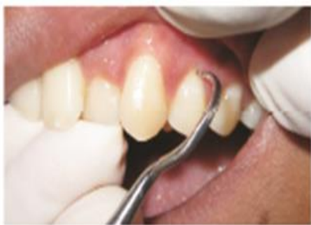
Fig. 1: Evaluation of Dentinal hypersensitivity by Tactile Method