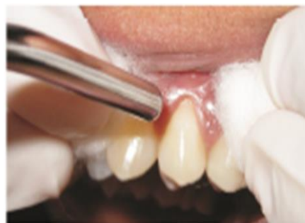
Fig. 3: Applications of Air Jet to evaluate Dentinal hypersensitivity (Air blast stimulation)

Dentinal hypersensitivity was assessed by,