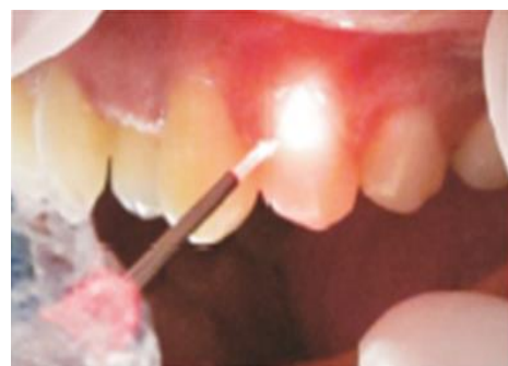
Fig. 7: Applications of Dental Laser on tooth

The collected data was subjected to statistical procedures like