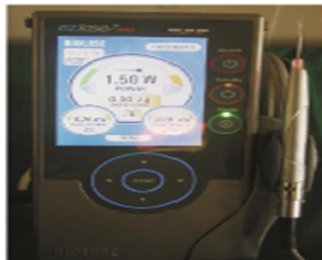
Fig. 6: Power Settings for Diode Laser