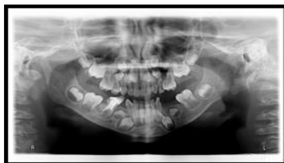
Fig. 3: OPG showing taurodontic 54, 55, 64, 65 & bilateral agenesis of mandibular second premolar

An orthopantomograph (Fig. 3) was advised which revealed that all maxillary deciduous molars (54, 55, 64, 65) were non carious and with enlarged pulp chambers suggesting taurodontism and bilateral congenitally missing mandibular second premolar. Taurodontism could not be commented in permanent first premolars and molars due to early developmental stage.