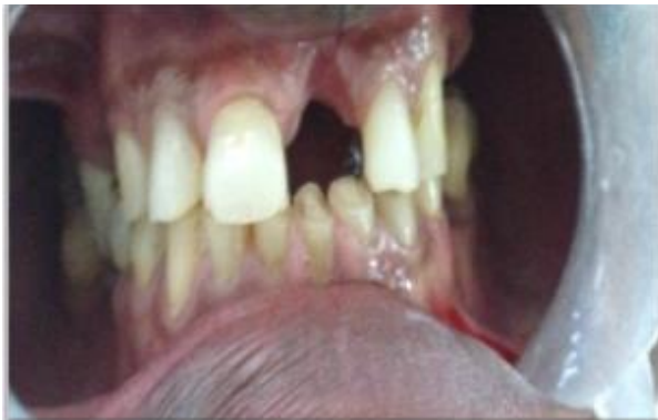
Fig. 1: Attrited mandibular anteriors and missing maxillary left central incisor (21)

canine (Fig. 9). Thus we got an accepted occlusal plane for the lower posteriors. To transfer this to mouth a wax guide is made and held against the teeth and preparation line 1.5 mm below the plane is marked on the teeth, giving space for the restoration (Fig. 10, 11). After the temporization of lower posteriors maxillary treatment RPD given in harmony with anterior guidance and condylar guidance (Fig. 12, 13). Temporization period for two month and patient is reviewed once in two weeks. Patient is comfortable with new bite (Fig. 14) and permanent crowns and maxillary cast partial denture were given (Fig. 15, 16). Pre and post treatment pictures are shown. (Fig. 17, 18).