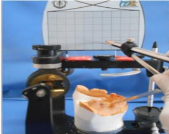
Fig. 7: Anterior survey line