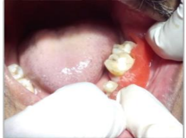
Fig. 11: Wax guide held against the teeth