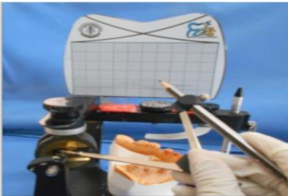
Fig. 8: Condylar survey line