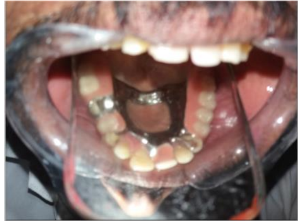
Fig. 16: Maxillary cast partial denture