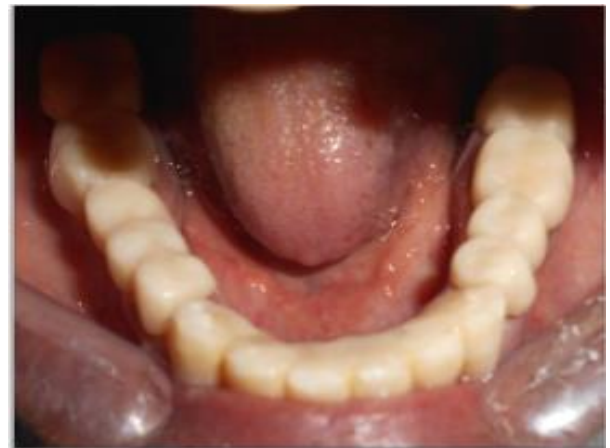
Fig. 12: Temporary lower crowns