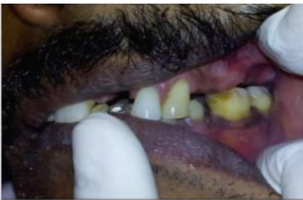
Fig. 2: Supraerupted mandibular left molars impinging maxillary alveolar ridge