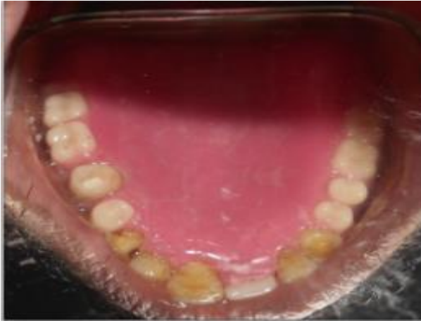
Fig. 13: Maxillary temporary RPD