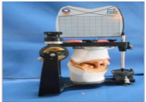
Fig. 5: Broadrick flag analyzer