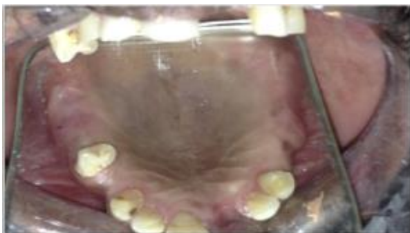
Fig. 3: Maxillary partially edentulous ridge (Kennedy class I modification 2)