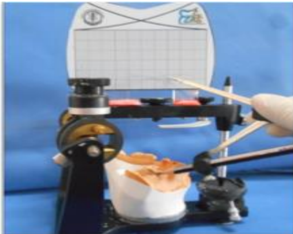
Fig. 9: Line is drawn from molars to canine from intersecting point