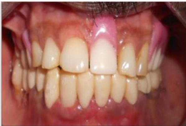
Fig. 14: Temporary full mouth occlusal rehabilitation with increased vertical dimension