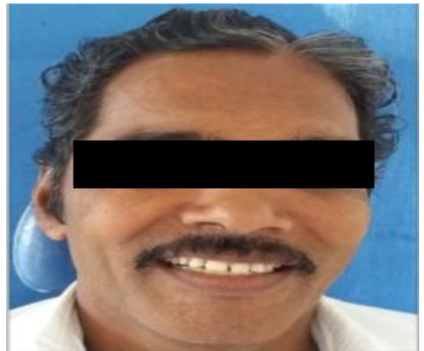
Fig. 18: Post-operative