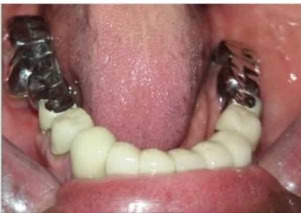
Fig. 15: Mandibular permanent crowns