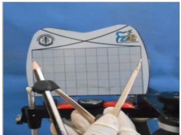
Fig. 6: Four inch radius is set for the caliper