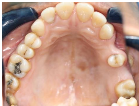
Fig. 1: Missing #24 and #26

A 48 year old female reported with the chief complaint of missing #24 and #26, difficulty in mastication and aesthetic issues (Fig. 1). Intraoral examination revealed the second premolar as non-carious and firm. Financial constraints prohibited the patient to opt for dental implants and hence, a five unit metal –ceramic FDP with the canine and second molar acting as terminal abutments and the second premolar as a pier abutment with a NRC was finalized as the treatment plan.