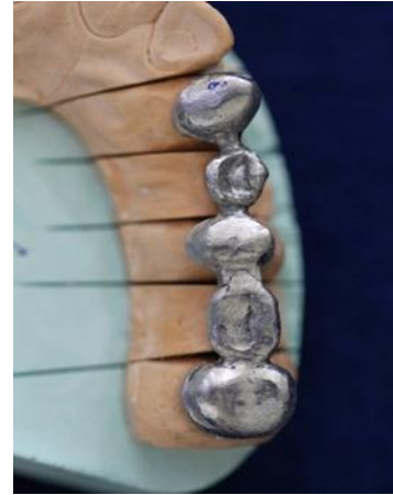
Fig. 4: Completed casting of anterior and posterior units with fitting of NRC

After the three unit casting with the female attachment was obtained, it was seated on the cast and the wax pattern of the posterior two unit FDP was made with a male attachment/ tenon extending into the previously casted customized female attachment. After the casting of the posterior two unit FDP (Fig. 4), it was fitted with the anterior unit and a metal coping trial was done in the patient's mouth (Fig. 5). After verifying the fit of the casting, as well as that of the customized tenon-mortise attachment, ceramic build up (Vita, Germany) was completed and the FDP was cemented (Fig. 6) after necessary occlusal adjustments using Glass Ionomer luting cement (Type I).