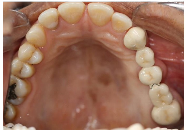
Fig. 6: Final Porcelain fused to metal prosthesis cemented intraorally