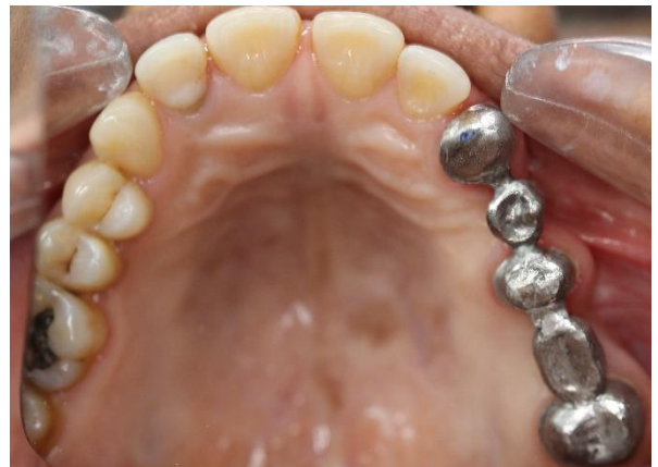
Fig. 5: Seating of the anterior and posterior copings and checking fit of the NRC intraorally