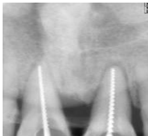
Fig. 7: Working length determination