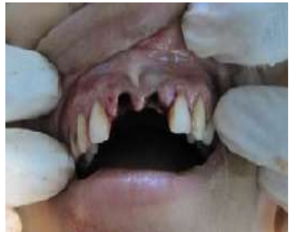
Fig. 2: Pre-operative Intra oral photograph