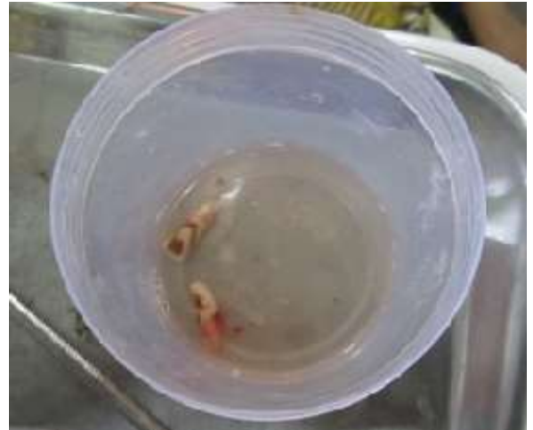
Fig. 1: Avulsed teeth brought stored in water

The patient was informed about the importance of regularly returning for clinical and radiographic follow-ups at interval of one month, 3 months, 6 months and one year.