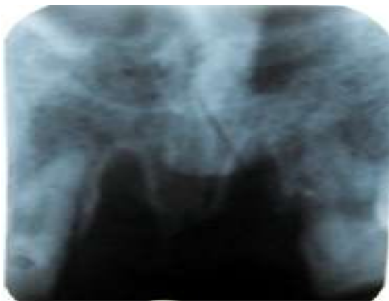
Fig. 3: Pre-operative IOPA Radiograph