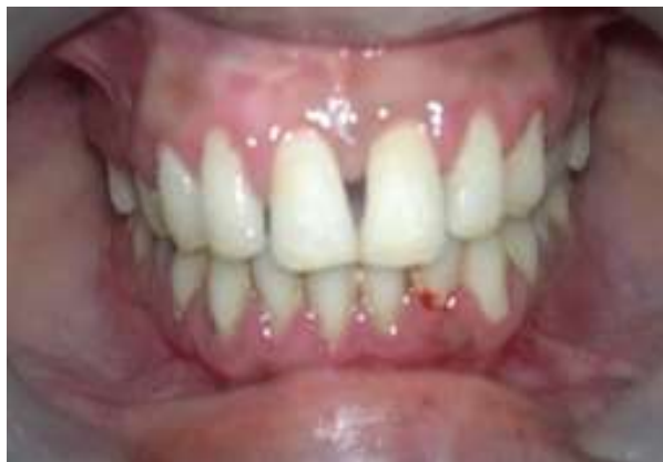
Fig. 9: Post endodontic intra oral photograph