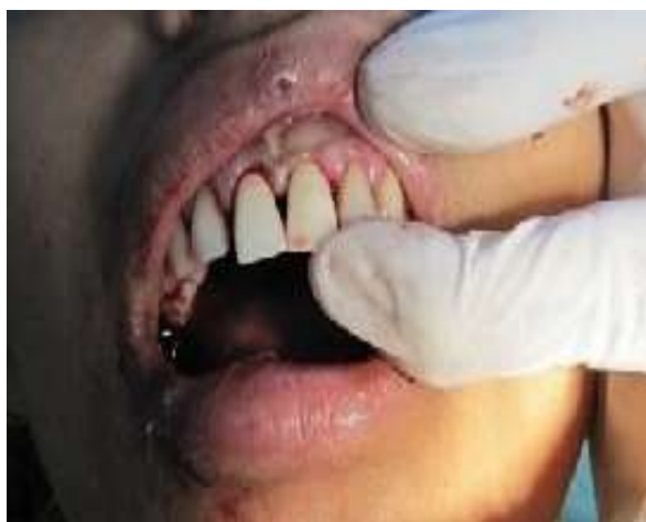
Fig. 4: Teeth replanted within socket