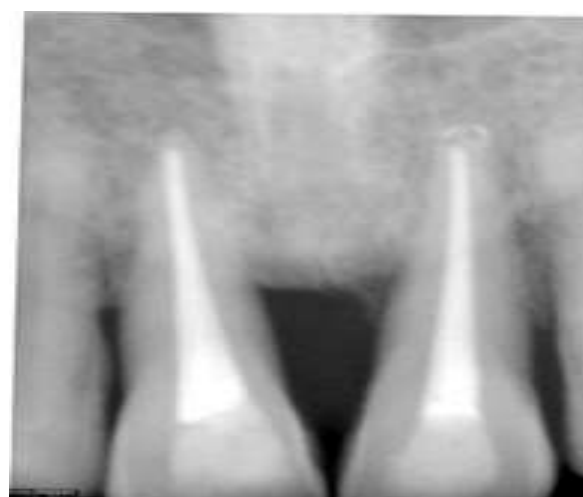
Fig. 8: Post-obturation IOPA Radiograph