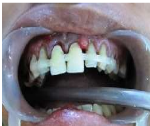
Fig. 5: Replanted teeth stabilized with Fiber splinting