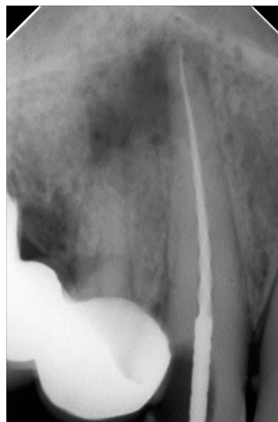
Figure 3: IOPA with Master file