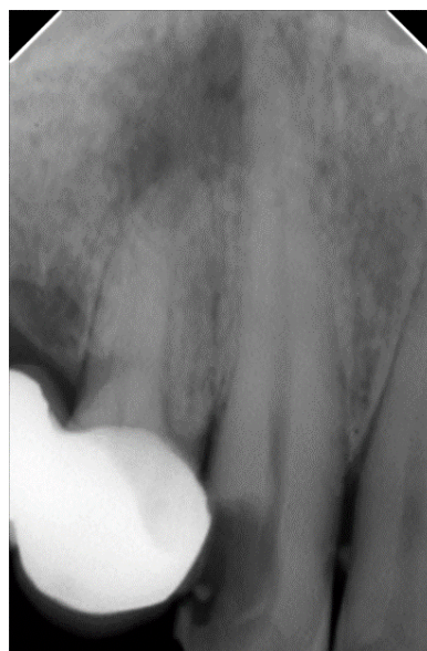
Figure 2: Pre-operative IOPA with Periapical radiolucency (13)