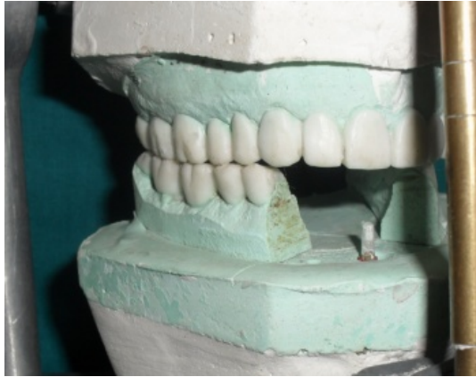
Fig. 8: Wax up posterior teeth-right