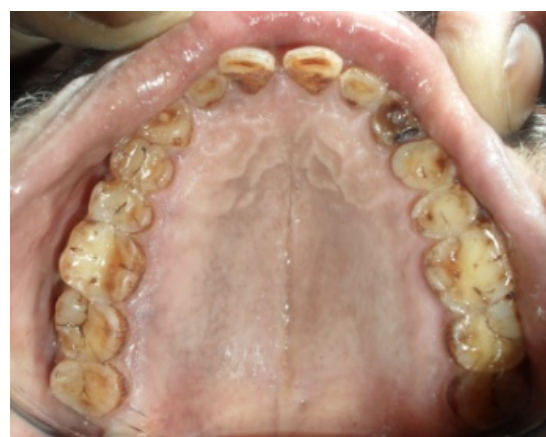
Fig. 1: Pre operative maxillary occlusal