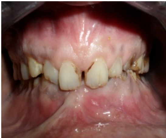
Fig. 3: Pre operative frontal showing over eruption of maxillary incisors