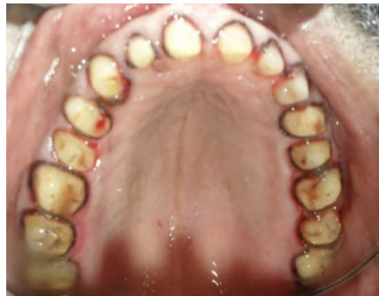
Fig. 12: Tooth preparation with retraction-maxillary