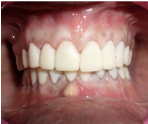
Fig. 15: Acrylic provisional restorations