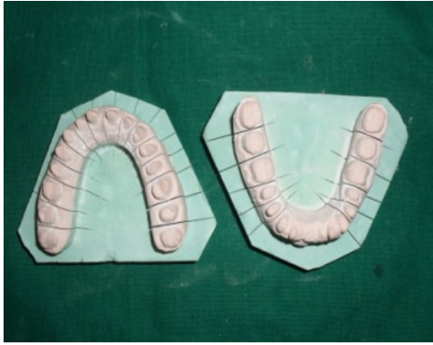
Fig. 14: Final casts with individual die