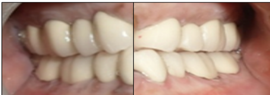
Fig. 17: Group function occlusion – right & left