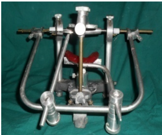
Fig. 4: Diagnostic face bow transfer