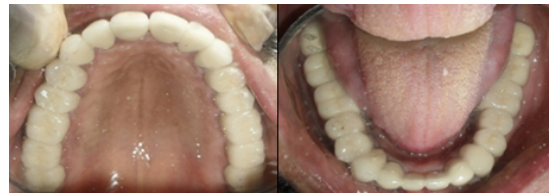
Fig. 18: Final PFM crowns - maxillary and mandibular