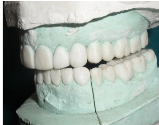
Fig. 11: Disocclusion in lateral excursions -left