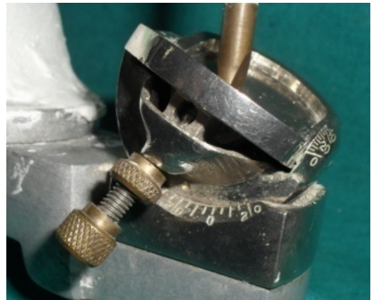
Fig. 6: Anterior guide table set to condition 1- 25°