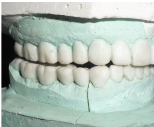
Fig. 10: Disocclusion in lateral excursions -right