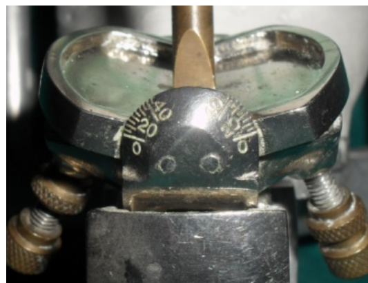
Fig. 7: Lateral wing set to condition 1- 10°