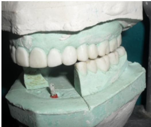
Fig. 9: Wax up posterior teeth-left