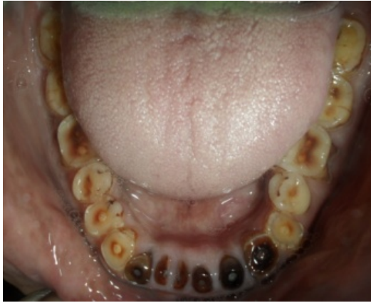
Fig. 2: Pre operative mandibular occlusal