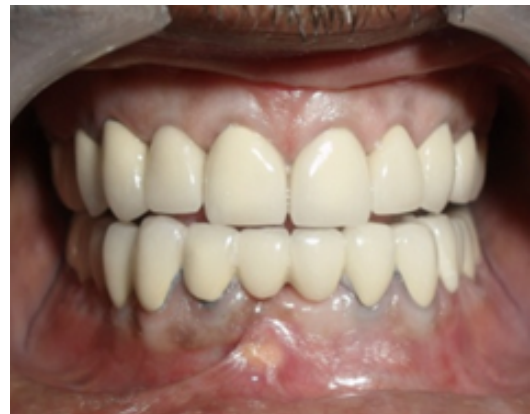
Fig. 20: Posterior disocclusion in protrusion