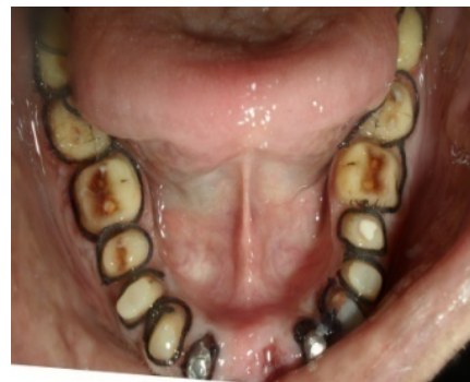
Fig. 13: Tooth preparation with retraction-mandibular