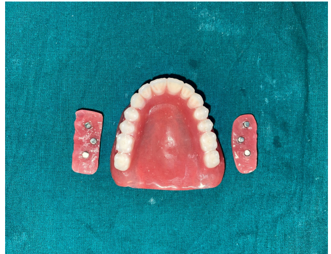
Fig. 4: Heat cured acrylized maxillary complete dentures and cheek plumpers