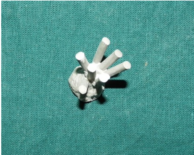
Fig. 1: Metal casted sprue