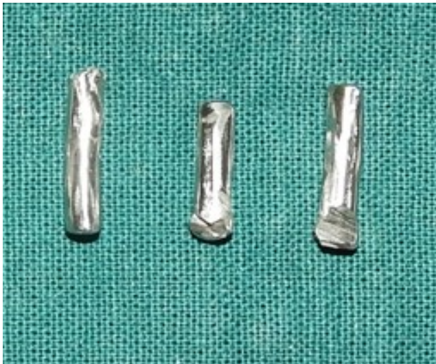
Fig. 2: Metal casted sprue of length 5mm.