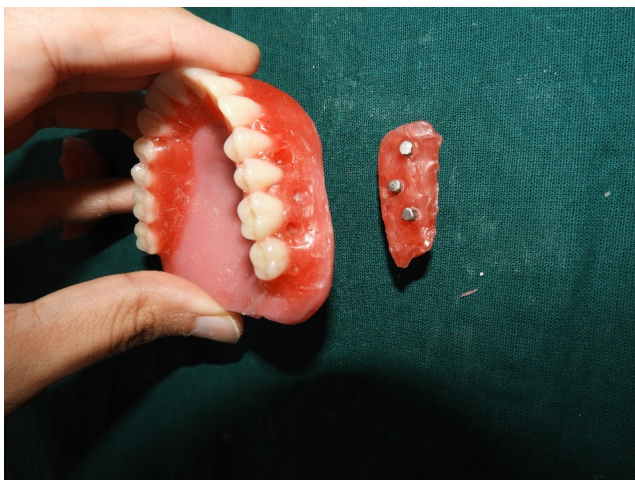
Fig. 3: Trial waxed up denture and detachable cheek plumper.