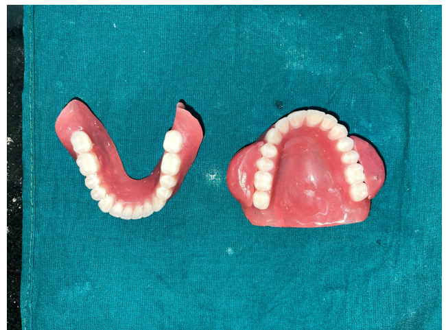
Fig. 5: Cheek plumper attached to maxillary complete denture