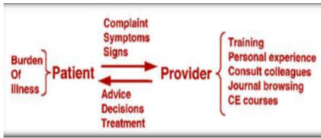
Fig. 1: Traditional model of practice

treatment options, without discrediting the structures in the previous model. It has an upper hand over the traditional model because of the increased confidence from evidence, without supplanting the existing clinical judgment.