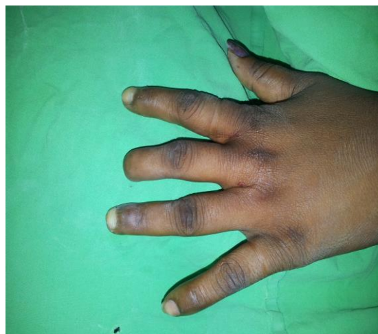
Fig. 1: Amputated middle Finger

Now the wax pattern along with model was invested into a flask with dental plaster and dew axing was done. The acrylic stains were mixed with heat cure acrylic resin to match color of the patient's finger on dorsal and ventral side and processing was done. After processing prosthesis was retrieved from mould. Excess flash was removed using acrylic trimming burs and finishing, polishing was done using fine sand paper. Some extra staining was done from outside to match the color of skin. The final prosthesis was placed onto the amputated stump and color and fit was evaluated (Fig. 5). Instructions were given about the use and maintenance of the prosthesis.