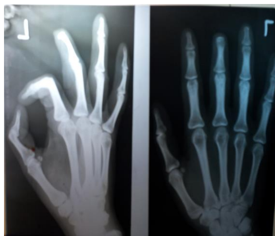
Fig. 2: Pre-operative radiograph of hand