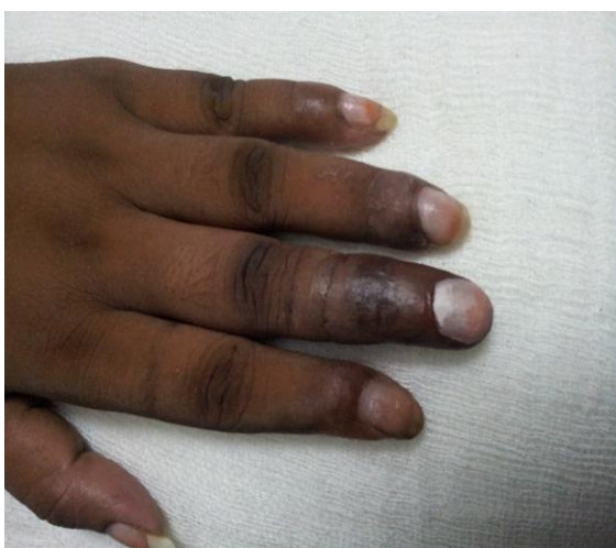
Fig. 5: Final prosthesis