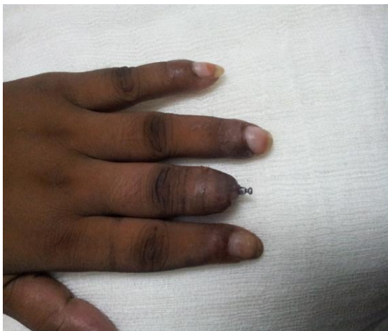
Fig. 4: Amputated finger after three months of implant placement