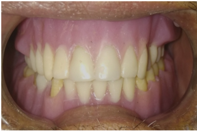
Fig. 9: Post-operative intra-oral photograph