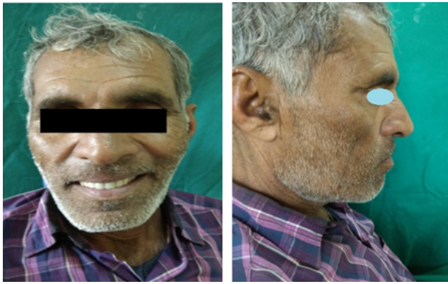
Fig. 10: Post-operative extra-oral photograph showing augmented cheeks