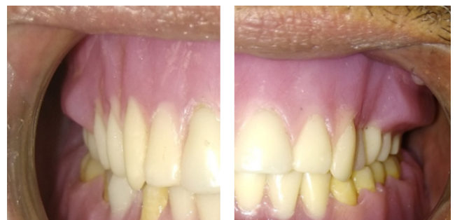
Fig. 8: Final prosthesis with hollow cheek plumpers of right and left side