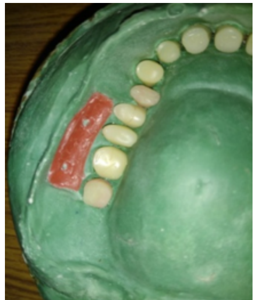
Fig. 6: Wax strip with orientation holes.