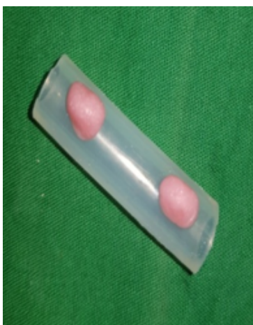
Fig. 5: Acrylic orientation plugs