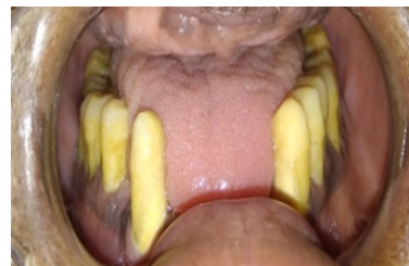
Fig. 2: Mandibular partially edentulous arch