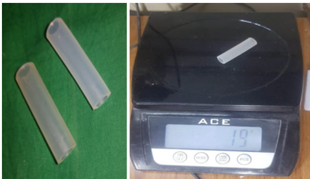
Fig. 4: Heat resistant, hollow PVC pipe ( weight = 1.9 gm)