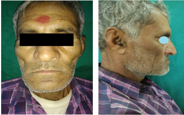
Fig. 3: Extra-oral photograph showing unsupported, sunken cheeks