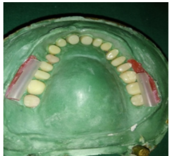
Fig. 7: Assembly until self cure plug sets and Wax-strip is later carefully removed