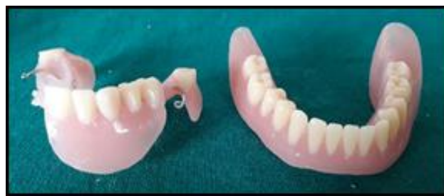
Fig. 9: Finished prosthesis

After implant surgery, patient was instructed not to wear the mandibular denture for 10-15 days. Patient was put on antibiotics for 7 days. To maintain oral hygiene patient was told use disinfectant mouth wash 3-5 times daily (Listerine). Patient was told to have soft and liquid diet. After one week patient was recalled and sutures were removed. To avoid selective pressure over implant site and to help osseointegration of implants the tissue surface of the mandibular denture was relieved. Tissue conditioner (GC Reline Soft TM) was applied to act as cushion between the occlusal force and tissue base. After trimming, finishing and polishing of the denture was done, prosthesis was inserted into the patients mouth (Fig 9-10).