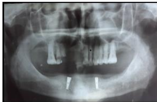
Fig. 8: Post op OPG

After implant surgery, patient was instructed not to wear the mandibular denture for 10-15 days. Patient was put on antibiotics for 7 days. To maintain oral hygiene patient was told use disinfectant mouth wash 3-5 times daily (Listerine). Patient was told to have soft and liquid diet. After one week patient was recalled and sutures were removed. To avoid selective pressure over implant site and to help osseointegration of implants the tissue surface of the mandibular denture was relieved. Tissue conditioner (GC Reline Soft TM) was applied to act as cushion between the occlusal force and tissue base. After trimming, finishing and polishing of the denture was done, prosthesis was inserted into the patients mouth (Fig 9-10).