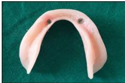
Fig. 13: Pic up denture

in the pick up space was trimmed and polished and final prosthesis of mandibular implant supported overdenture and maxillary flexible RPD was inserted. (Fig. 13-15)