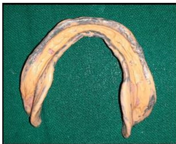
Fig. 4: master impression

Mandibular complete denture and maxillary RPD was fabricated using conventional steps for denture fabrication. Fabrication of mandibular denture and maxillary RPD was useful for interarch space analysis (Fig. 4-5)