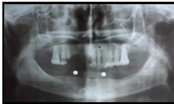
Fig. 3: Position B and D

Orthopantomogram (OPG), diagnostic casts and records were studied. According to the Misch's overdenture criteria – OD1 12 two Implant were planned at B and D positions. (Fig. 1-3)The whole treatment was divided into three parts: (1) mandibular denture fabrication, (2) implant placement (surgery), and (3) 2 nd stage (prosthesis engagement after three months).