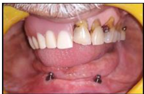
Fig. 11: Attachment abutments

After three months, implant sites B & D position were exposed, cover screws were removed. Normal saline was used to flush the implant sites. At this stage healing collars were placed, and tissue around the implants sites was left undisturbed to mature for one month. Before proceeding with pick up of denture with attachments, denture stability, fit and comfort was checked. 2mm diameter of ball and socket type of overdenture attachment was used. (Fig.11-12)