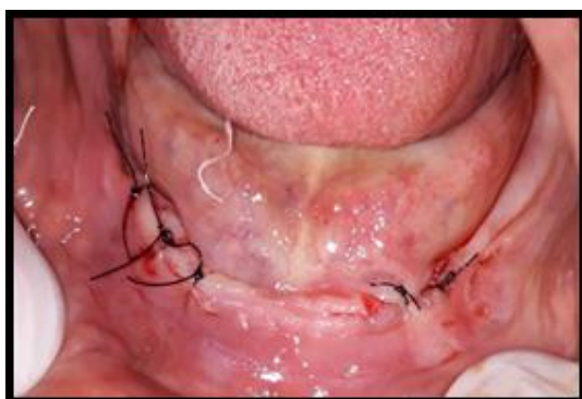
Fig.7: Flap closure