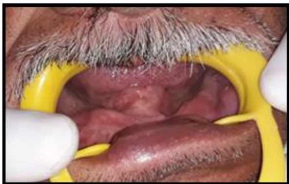
Fig. 1: Pre op

A 67 year old male reported to the Department of Prosthodontics, Himachal Dental College and Hospital, Sundernagar, Mandi, India, with the chief complaint of loose-fitting of mandibular denture. Patient had been completely edentulous in mandibular arch and partially edentulous in maxillary arch since last 1.5 years. Patient had been using mandibular complete denture and maxillary removable partial denture for past 6 months and was not satisfied with lower denture due to lack of retention and difficulty in chewing food. On clinical examination ridge relation was class I and Mandibular ridge resorption was Atwoods class IV. There were many treatment options available and most appropriate treatment option to rehabilitate the patient was mandibular implant-supported overdenture opposing maxillary removable partial denture.