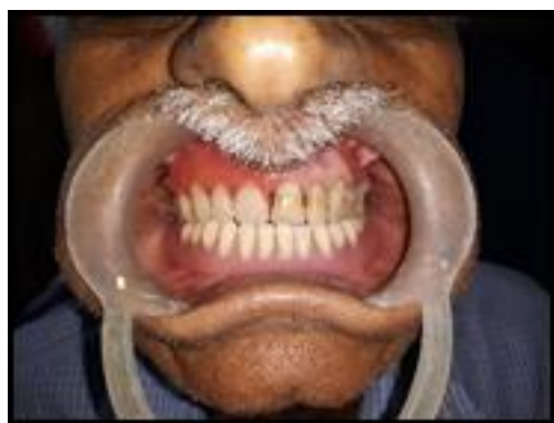
Fig. 15: Final prosthesis