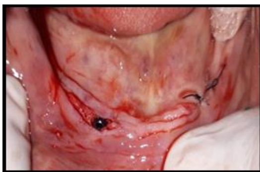
Fig.6: Implant placement

Two (bio-line) implants of 3.75 \times 11 .mm 5 were selected at B and D positions. Attachment system used for this case was Ball and socket type. Under local anesthesia implant placement was performed. The osteotomy at B and D region of mandibular arch was prepared. Parallelism was checked using guide pin between the implants. The selected implants were placed after osteotomy of the B & D region. Cover screws were placed and flaps were closed with sutures (Nylon 4-0). (Fig. 6-8)