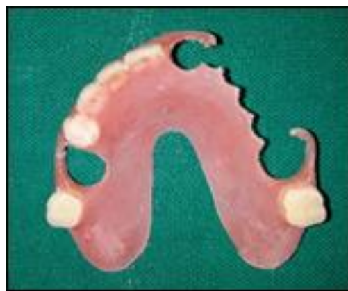
Fig. 14: Flexible RPD