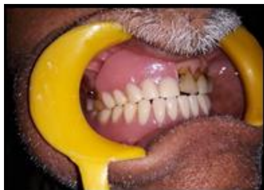
Fig. 10: Insertion of prosthesis