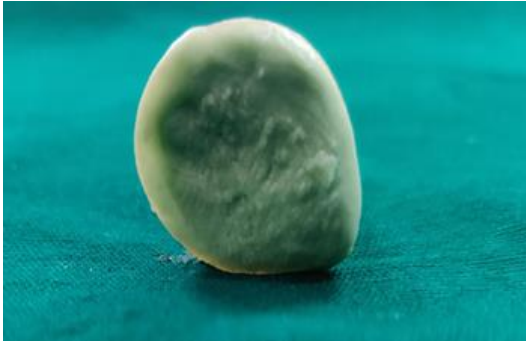
Fig. 2: Ocular impression