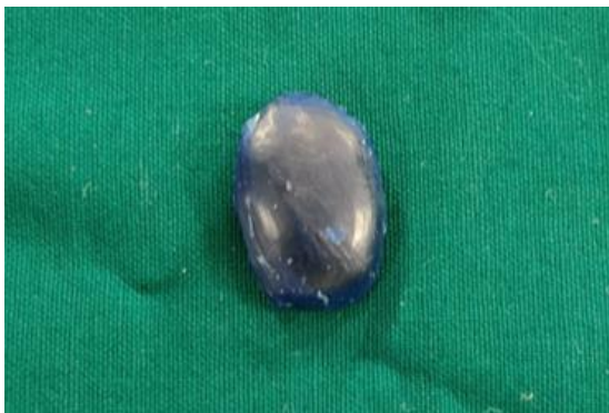
Fig. 4: Scleral wax pattern