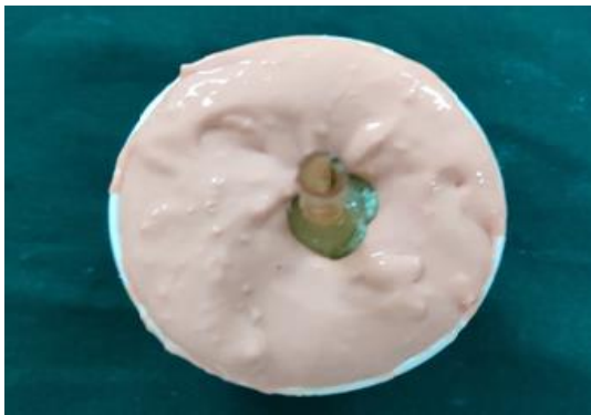
Fig. 3: Impression poured in a different colour alginate