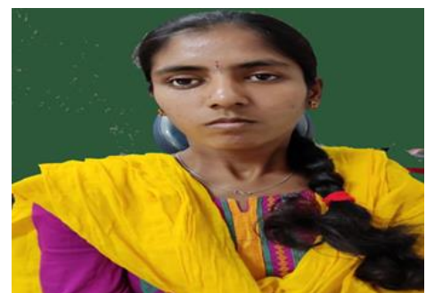
Fig. 9: Post treatment