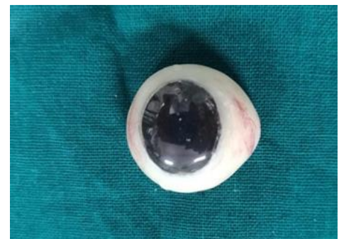
Fig. 8: Final ocular prosthesis