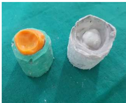
Fig. 5: ocular impression poured and two piece cast is retrieved