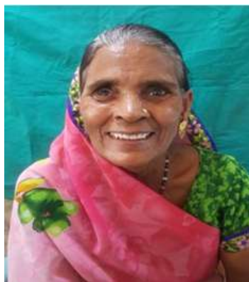
Fig. 8: Post op view; eye prosthesis and denture delivered