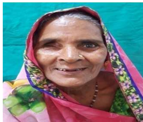
Fig. 1: Preop front view showing defective right eye and missing teeth

After processing, the ocular prosthesis was inserted in the right ocular defect. The final fit, contour, shade matching and life like appearance were verified. Post insertion instruction was given to patient. Patient was recalled after regular interval for follow-up. During follow-up, no irritation, allergy, watering was found. Patient was also maintaining the ocular prosthesis properly and was fully satisfied with it. 6-19 Fig. 8