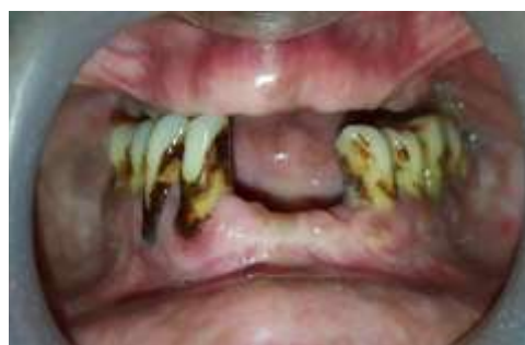
Fig. 2: Preop intraoral front view showing missing teeth