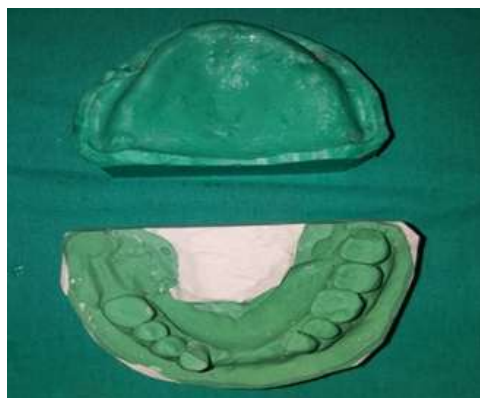
Fig. 4: Maxillary and mandibular master cast