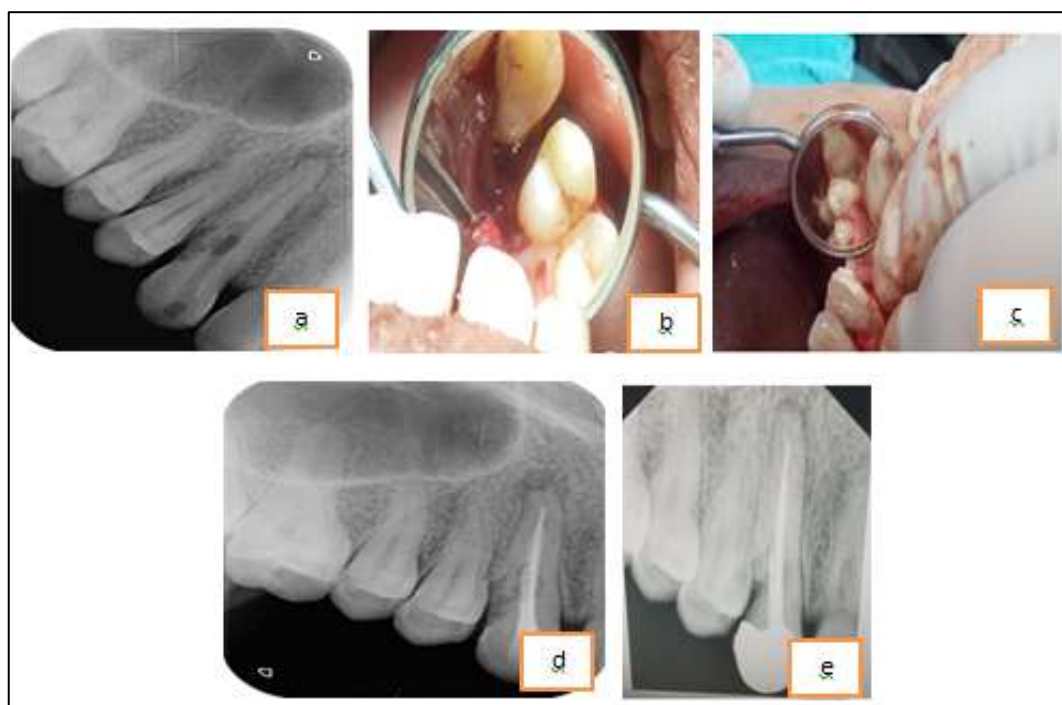
Fig. 2: (a) Pre-operative radiograph; (b) After granulation tissue removal; (c) Repaired with biodentine; (d) Follow-up after three months; (e) After twelve months follow-up