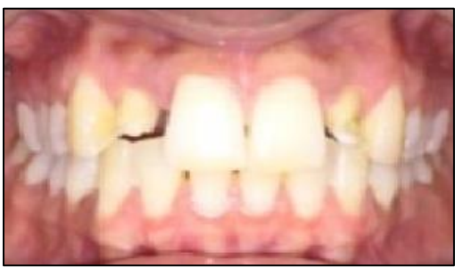
Fig. 5: Teeth preparation