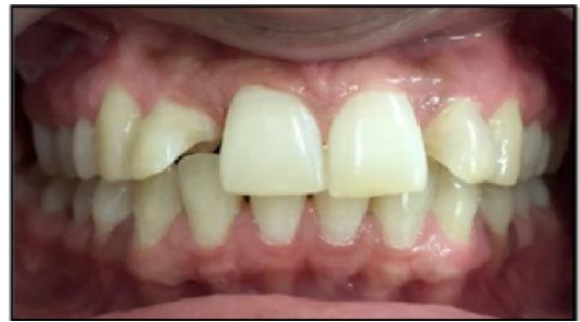
Fig. 1: Preoperative intraoral photograph