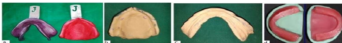
Fig. 1. a: Preliminary impression

A customized tray was fabricated and border molding was performed using the low fusing Type I impression compound (green stick) to represent the muscle activity and for recording the functional depth and width of the sulcus. The final impressions were made using the low viscosity mucostatic zinc oxide eugenol paste and the master cast was poured in dental stone. Fabrication of wax occlusion rims were done on maxillary and mandibular cast.