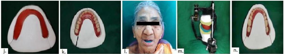
Fig. 3. j.: A plaster index was made for upper compound rim for the occlusal rim in wax Fig. 3. k., n.: Teeth setting was done with the help of the plaster index. Fig. 3. l., m.: Neutral zone for mandible was recorded

arrangement was done with the help of the plaster index. During the setting of the teeth their position was checked by putting the indices together around the wax try-in. Wax Try-in was done.