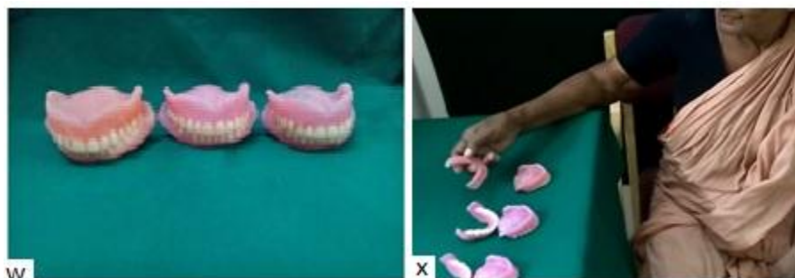
Fig. 8. w.: (Left to right) Hollow denture in neutral zone, denture in neutral zone, conventional denture Fig. 8. x: Selection of the denture by the patient

patient was asked to choose one set of denture which she was comfortable with. Among the three dentures, patient chose hollow denture over the rest two.