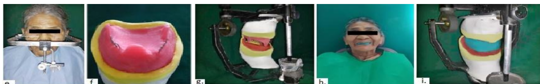
Fig. 2. e: Facebow recorded and transferred to Hanau articulator. Wax rims were used to record a tentative vertical dimension and centric relation and was transvered to the articulator.

neutral zone was done by asking the patient to perform a series of actions designed to simulate the physiological functioning like swallowing, drink water, whistling, pursing the lips. Tray was carefully adjusted in the articulator; occlusal plane was established for the upper arch by placing the upper compound rim and lower wax rim in CR. A plaster index was made around the molded impression compound rim upper compound rim to fabricate the wax occlusal rim by pouring wax into the space giving an exact representation of the neutral zone.