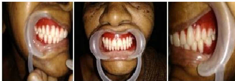
Fig. 4: Try-in done