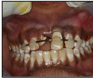
Fig. 3: Composite Splinting