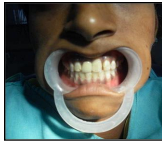
Fig. 6: 1 Year Followup photograph