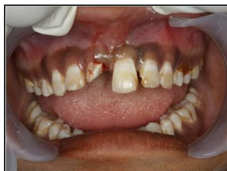
Fig. 1: Preoperative Photograph

An 18 year old girl reported to the department of Conservative Dentistry and Endodontics, with a chief complaint of trauma to the upper anterior teeth, due to fall from a tree. Extra-oral examination showed bruises on the chin, and intra-oral examination revealed avulsion of 21, and Ellis class 3 fractures of 11, (Fig. 1). The attendant (father) of the patient collected the avulsed tooth and stored in milk after the accident.