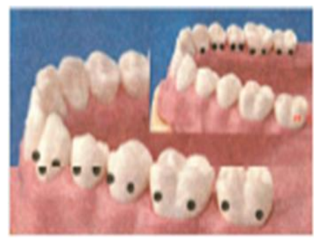
Fig. 5: Systemic representation of areas of application of Diode Laser