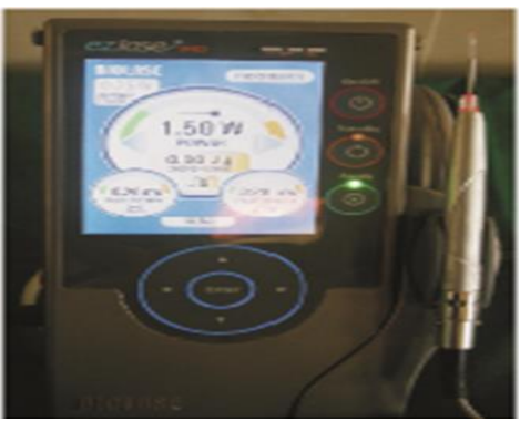
Fig. 6: Power Settings for Diode Laser