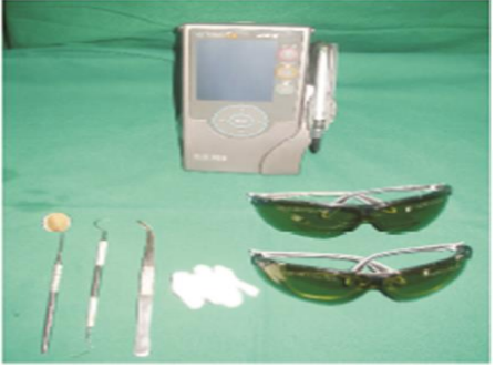
Fig. 4: Diode Laser with protective Eye Wear

Each group was recalled at weekly intervals for two consecutive weeks and at 1, 3 and 6 months. Hypersensitivity scores were recorded before and after therapy using Visual Analog Scale at all follow-up visits.