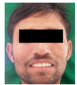
Fig. 7: Post-operative view