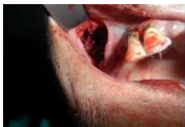
Fig. 4: Post-surgical view

Surgical Care: As the patient was also having laryngeal obstruction of the second degree (granulomatous stage) hence tracheostomy was also done. Extensive granulomatous lesions were excised for quick recovery. Plastic surgery was also performed under GA as imperforation remained in the nasal cavity & pharynx.