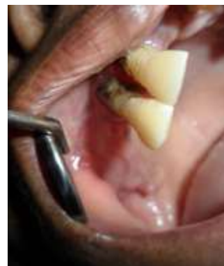
Fig. 5: Post-surgical view after 02 months

Recall visit: Patient was recalled after 01 month and the healing were found to be uneventful.