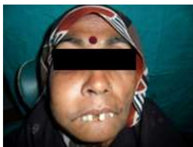
Fig. 1: Extra-oral view

Pain aggravated during meal and subsided after medication. Swelling gradually increased in size.