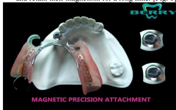
Fig. 6: Magnetic Precision Attachments

Magnet used nowadays Samarium cobalt (Sm -co), Neodymium iron boron (Nd-Fe-B) – 20% strong per unit volume than the cobalt – samarium alloy, Samarium-iron-nitride. (13)