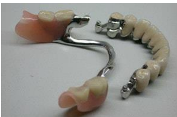
Fig. 5: Extracoronar Attachment in Distal Extension

These attachments are employed to reduce the stresses on the abutment teeth and transfer them to the denture bearing areas.