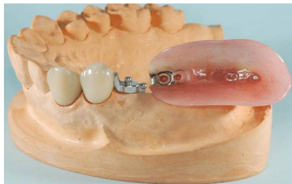
Fig. 3: Semi Precision Attachments