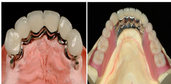
Fig. 4: Extracoronar Attachments with Crowns

Extracoronar attachments provide only retention but not the lateral force transmission (bracing) or occlusal force transmission (support) required from a removable partial denture retainer. Application of these attachments is in distal extension partial denture when a mechanical stress breaker is required. (Kennedys Class I and Class II).[Figure 5]