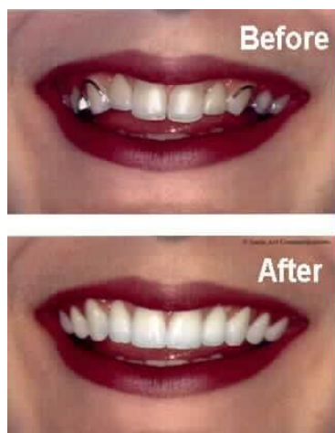
Fig. 2: Improved Aesthetics with Precision Attachments