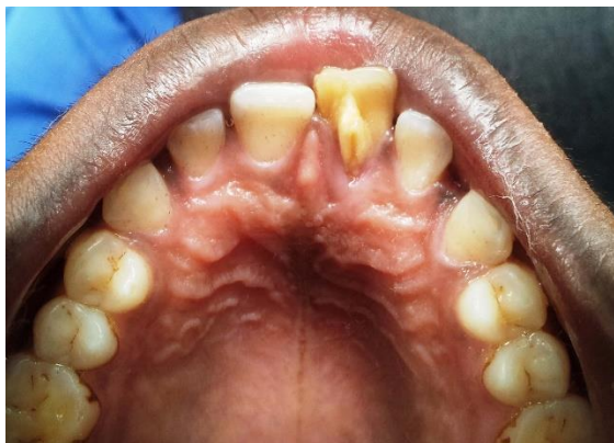
Fig. 1: Supernumerary cusp on the palatal aspect of 21 suggestive of a Talon cusp