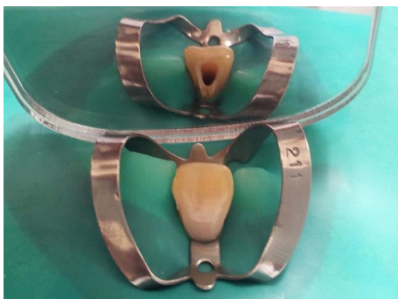
Fig. 2: Access opening on the palatal aspect of 21 after grinding of the Talon cusp