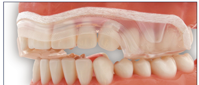
Fig. 2: Self adjusting occlusal balance facilitated by aqualizer