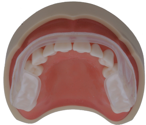
Fig. 1: Fluid chambers placed between occlusal surface of posterior teeth

Occlusal appliances are so versatile that they may be used in countless number of ways for different purposes like occlusal stabilization, prevention of wear of teeth or for treating different types of TMDs. According to Jeffrey P. Okerson, occlusal appliance can be a muscle relaxation appliance/ stabilization appliance used to reduce muscle activity, anterior repositioning appliance / repositioning appliance, anterior bite plane, pivoting appliance or a resilient appliance. Peter E. Dawson categorises them as permissive splints / muscle deprogrammer, directive splints / non-permissive splints and pseudo permissive splints like soft splints and hydrostatic splints. 5 Anterior deprogrammers are useful in decreasing muscle activity in clenchers. Anterior repositioning splints are very useful in TMJ overload and disc displacements. Full coverage splints sometimes can increase the muscle activity over time and complicate breathing pattern. 1