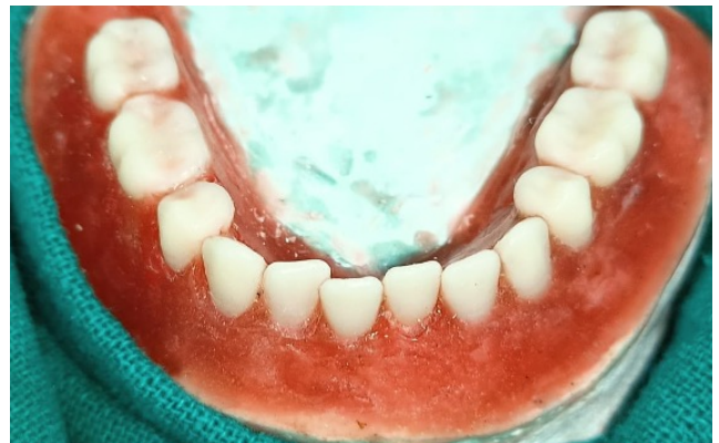
Fig. 5: Misaligned mandibular central and lateral incisors

looking. She was told about the treatment procedure and she gave consent for the adding intrinsic stains to the denture base and aligning the artificial teeth in a modified way to give natural appearance.