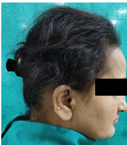
Fig. 2: Lateral view of patient

Patient was aesthetically conscious and psychologically affected, thus she desired for her denture to be natural