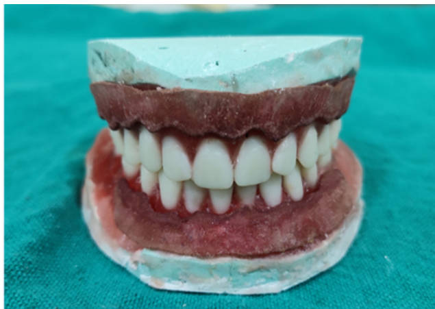
Fig. 8: Colored templates with scalloped borders adapted on waxed up cast