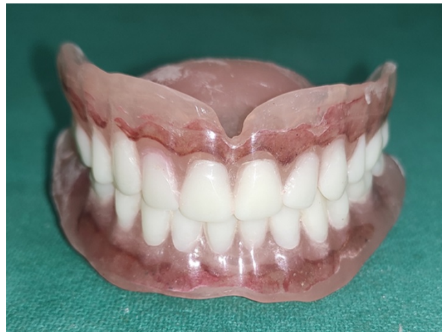
Fig. 10: Characterized complete denture with modified teeth arrangement