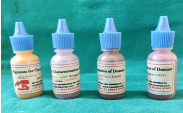
Fig. 6: Acrylic based denture characterization pigments for intrinsic stains