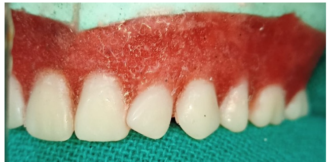
Fig. 4: Tilting and slight overlapping of lateral incisor