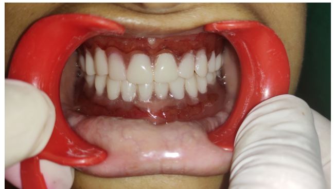
Fig. 11: Intraoral view of patient post denture insertion