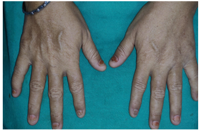
Fig. 3: Brittle and grossly deformed nails

Patient was aesthetically conscious and psychologically affected, thus she desired for her denture to be natural