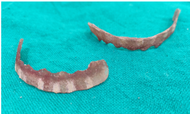
Fig. 7: Stained self-cure acrylic templates