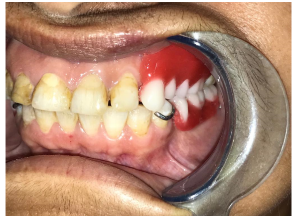
Fig. 2: Try in lateral 1.