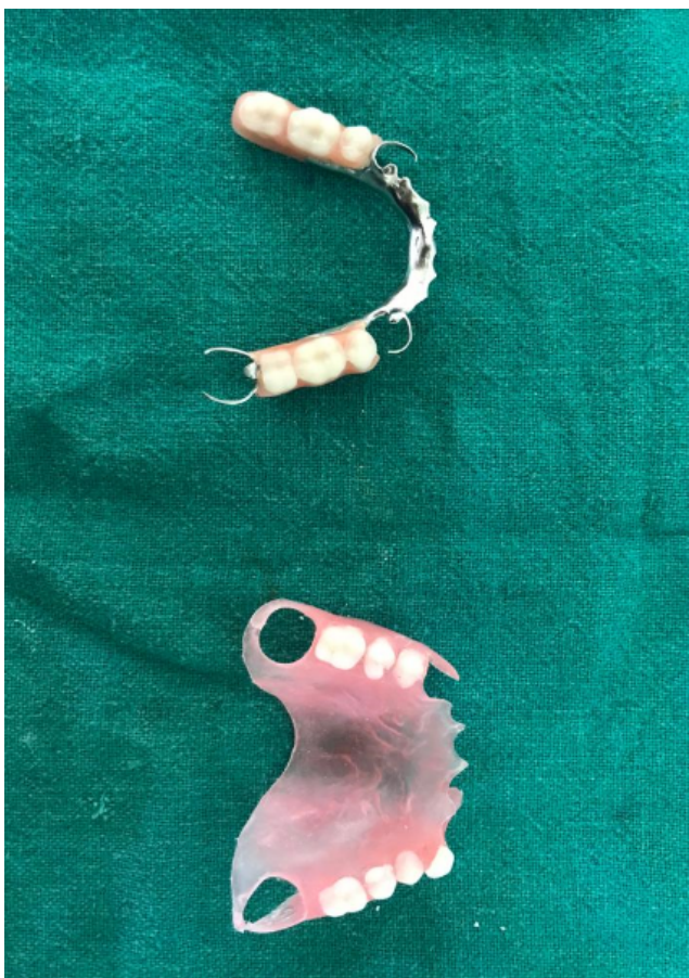
Fig. 5: Final upper flexible and lower cast partial denture.