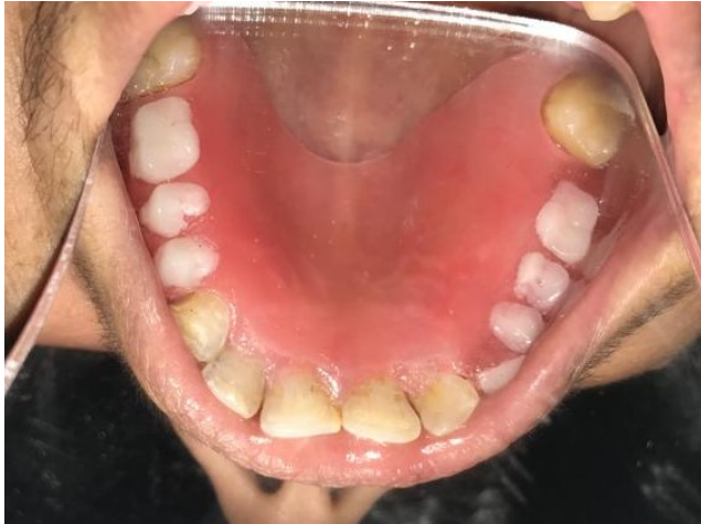
Fig. 4: Intra oral view of flexible partial denture.

Removable partial dentures are important part of prosthetic dentistry as they are cheaper option for patients. Modern dentistry is now inclined towards flexible material for removable partial dentures (RPDs) because it is more retentive and have no metallic clasps so that patient acceptance is more. Flexible material eliminates the invasive procedures and provides a prosthesis which is comparatively less bulky, more retentive, more esthetic and to a large extent clinically unbreakable after accidental fall. The partially edentulous arches encountered a special challenge in fabrication of partial dentures due to various paths of placement, tilted teeth and deranged occlusion. Flexible