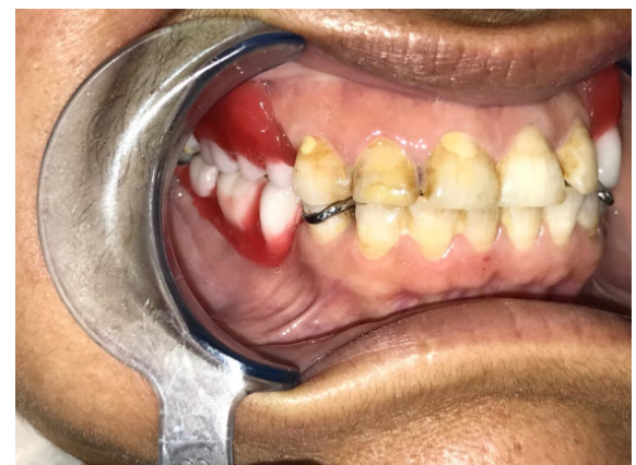
Fig. 3: Try in lateral 2.