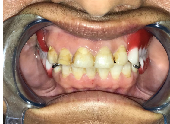
Fig. 1: Try in – frontal.

Partial maxillary flexible denture and mandibular cast partial denture was planned.