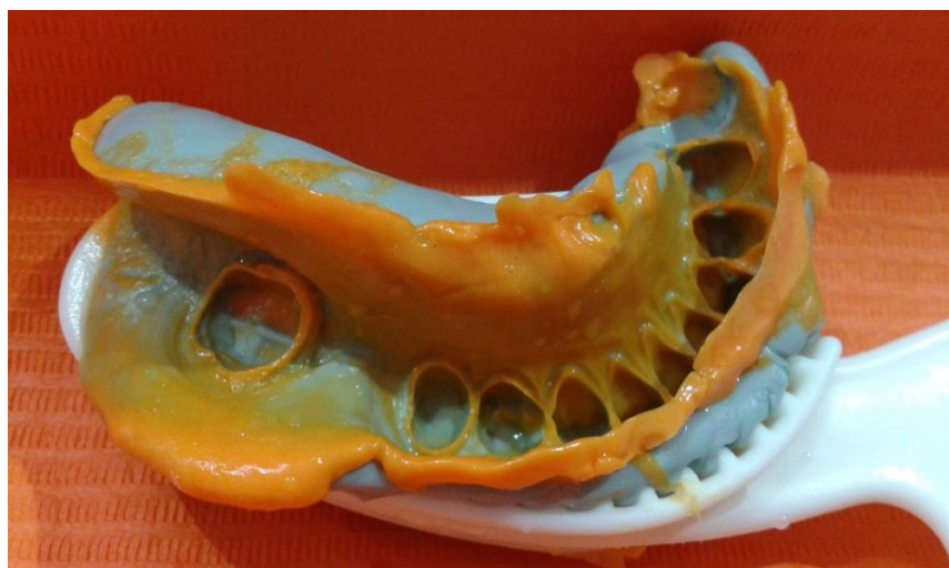
Fig. 2: Partial dental impression with partial dual arch plastic tray, two-step technique, for 3 unit porcelain fused to metal bridge