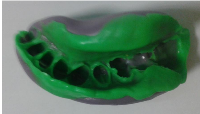
Fig. 3: Partial dental impression without tray, two-step technique for single crown