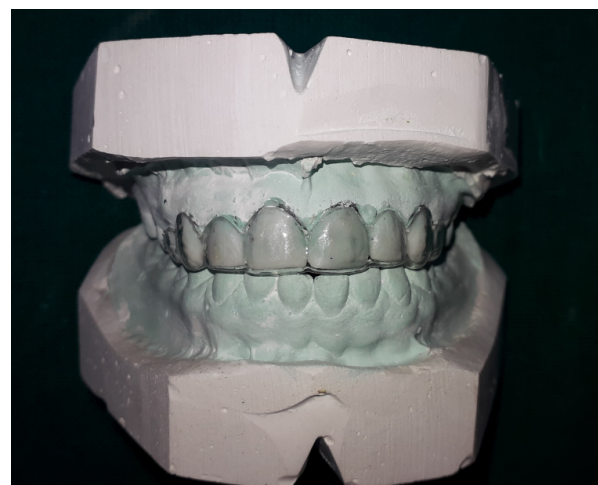
Fig. 3: Splint sheet adapted on waxed up cast.