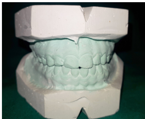
Fig. 1: Diagnostic Cast.

In this era, where looks hold the key to success and confidence, smile designing has emerged as a powerful tool for patients with facial or dental discrepancies. Factors