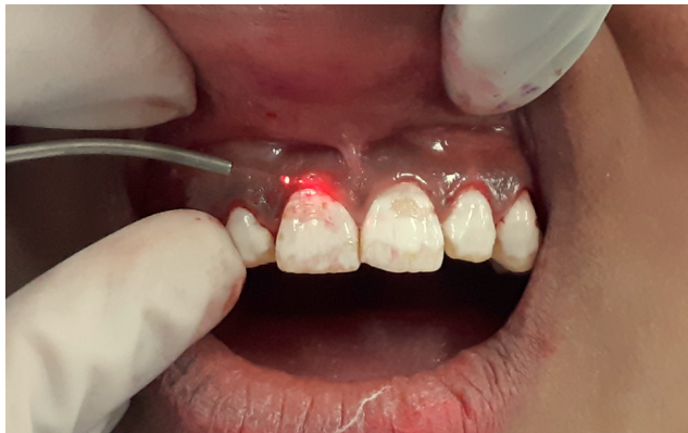
Fig. 5: Zenith correction done via Nd: YAG laser.