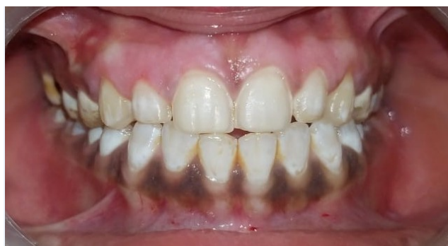
Fig. 7: Tooth prep done after healing of gingival tissues.