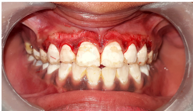
Fig. 6: Gingival depigmentation done.