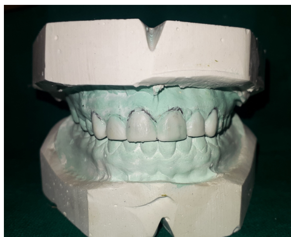
Fig. 2: Wax up done on diagnostic cast.