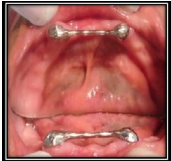
Fig. 6: Copings and Metal bar try-in (Intraoral)