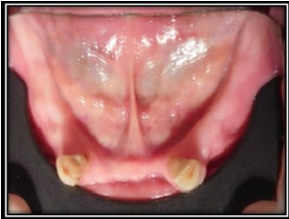
Fig. 2: Pre Op Mandibular (Intraoral)