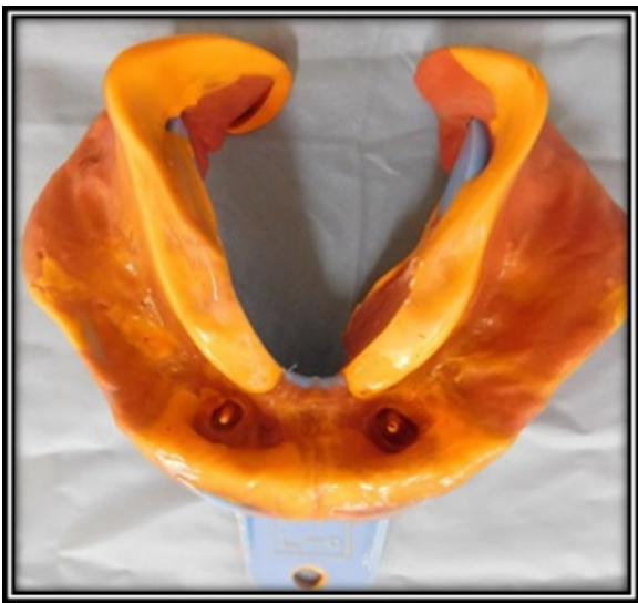
Fig. 3: Abutment teeth impression