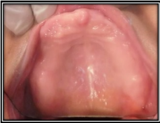
Fig. 1: Pre Op Maxillary arch (Intraoral)