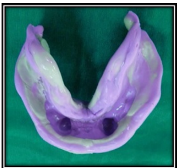
Fig. 7: Final impression