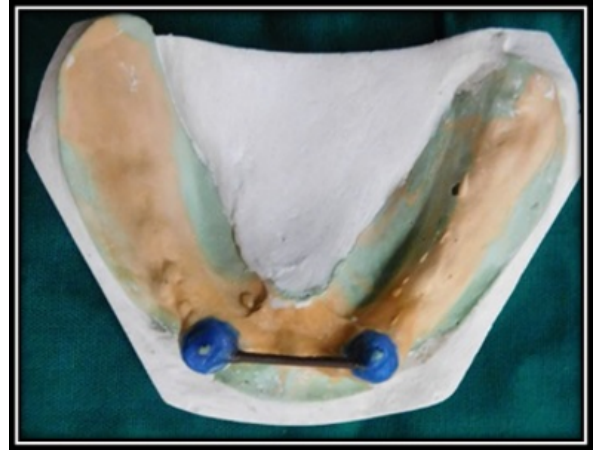
Fig. 4: Inlay wax pattern for customised bar