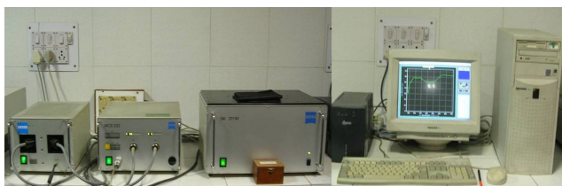
Fig. 1: Gonioreflectometer (Zeiss) for color assessment on CIELab Scale

The color change results for injection molded flexible denture base resin material, Lucitone FRS, a polyamide type material in the coffee and turmeric solutions (Graph 1) and its comparison with a conventional heat cure resin in this study were consistent with the study conducted by Takabayashi for the same materials in coffee and curry solutions. 16