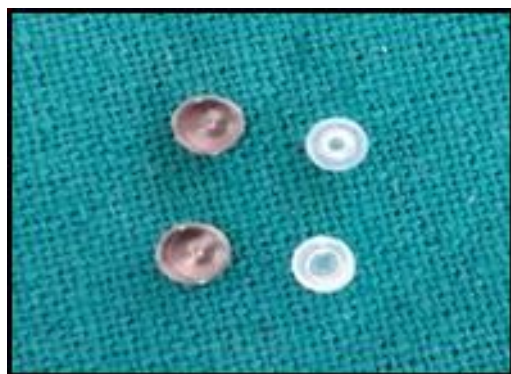
Fig. 12: metal housing and silicone rings

Firstly the seating of the abutments was checked. Interfering contacts of denture and attachment was verified by using pressure indicating paste (PIP). A round bur of no.6 was used to make the space for abutment attachment. After that patient was instructed to close mouth with normal occlusal pressure, while resin polymerise in the pick up space. The extra resin